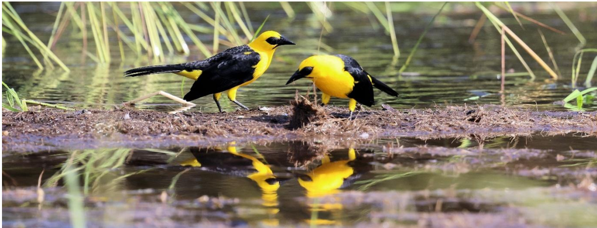
Oriole Blackbird © Chris Collins May 2024

Moustached Wren Pheugopedius genibarbis Buff-breasted Wren Cantorchilus leucotis Southern House Wren Troglodytes musculus Tropical Gnatcatcher Polioptila plumbea Pale-breasted Thrush Turdus leucomelas White-lored Euphonia Euphonia chrysopasta Yellow-browed Sparrow Ammodramus aurifrons Red-breasted Meadowlark Leistes militaris Crested Oropendola Psarocolius decumanus Olive Oropendola Psarocolius bifasciatus Yellow-rumped Cacique Cacicus cela Orange-backed Troupial Icterus croconotus Giant Cowbird Molothrus oryzivorus Shiny Cowbird Molothrus bonariensis