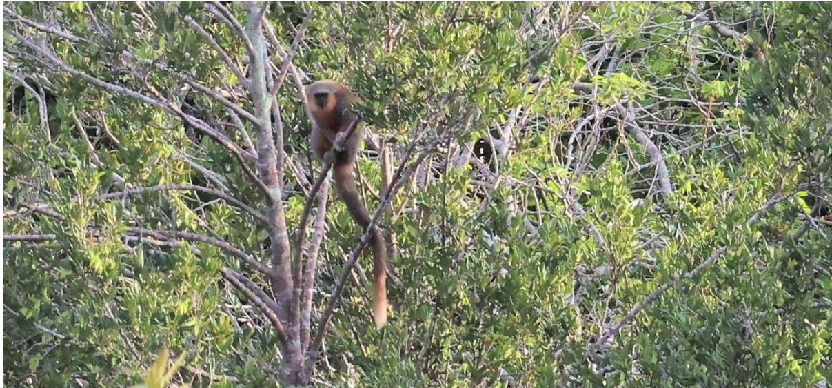
Red-bellied (Dusky) Titi © Chris Collins May 2024

Two individuals were seen during the canoe ride at Alter do Chaõ on 27 May.