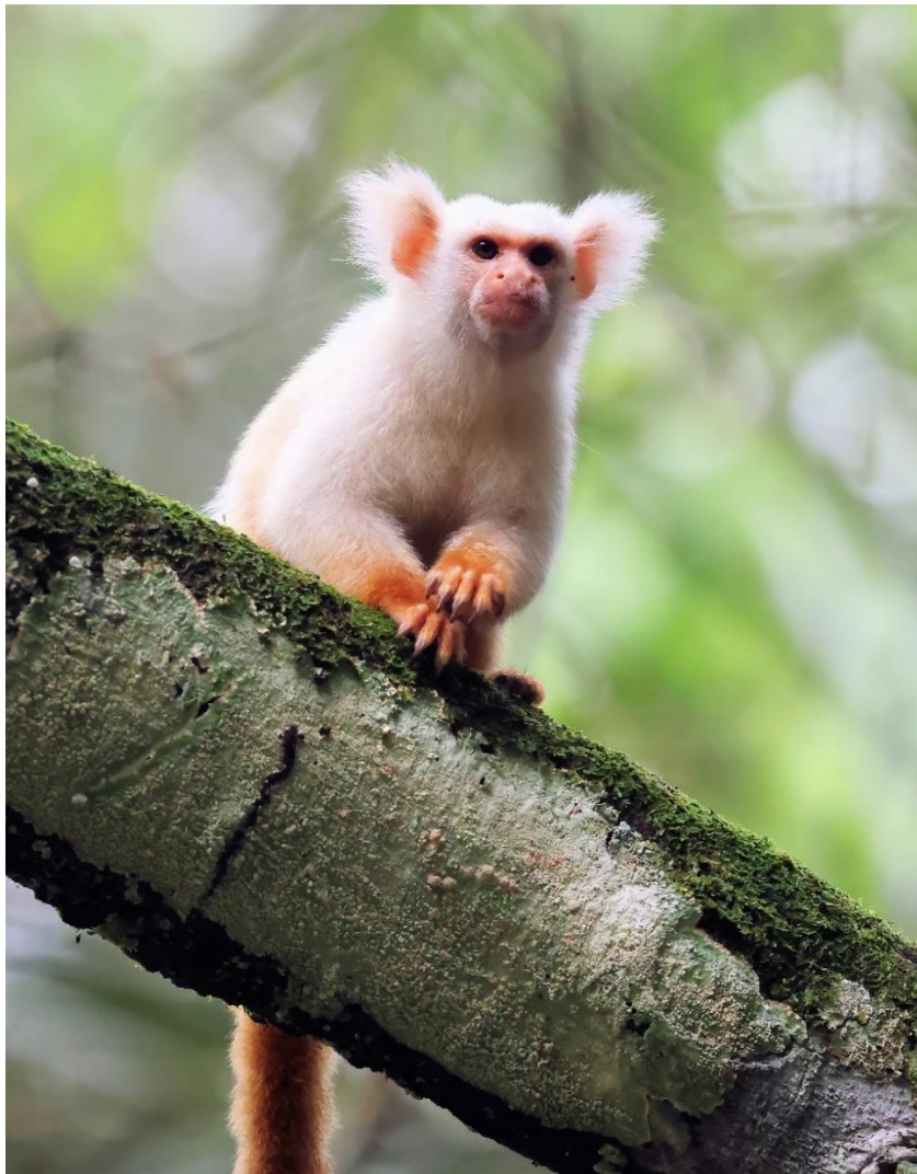
Golden-white Tassel-eared Marmoset