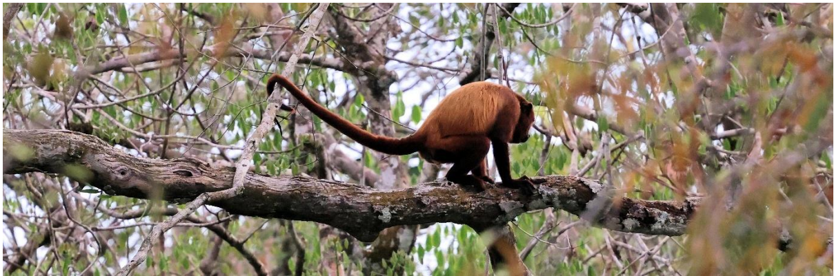
Guianan Red Howler

This species is found west of the Rio Negro so we were only in range at the very beginning of the voyage and it was found at Xiboreninha on 16 May.