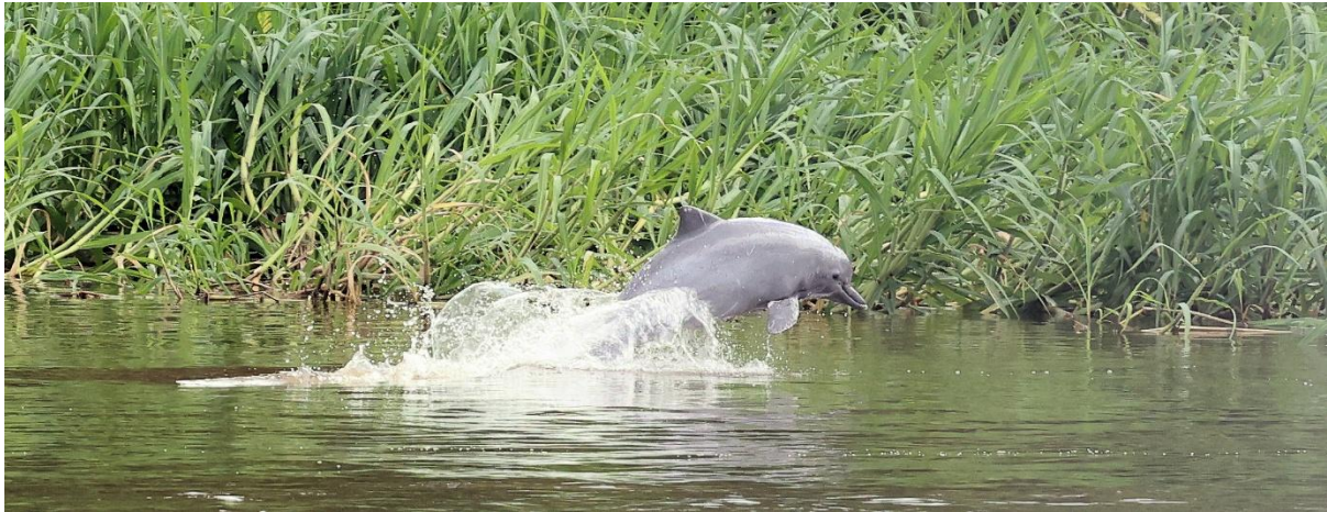
Tucuxi

Seen on a daily basis from 16 May onwards.