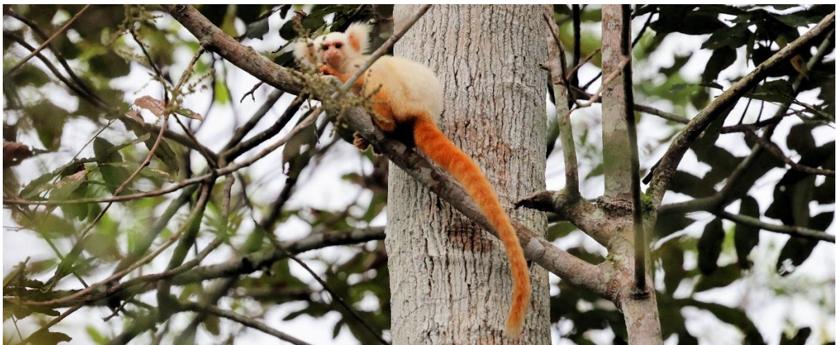
Golden-white Tassel-eared Marmoset