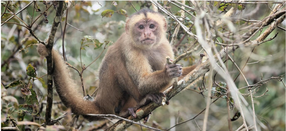
Humboldt's White-fronted Capuchin

We got very close to a troupe of this species which was calling loudly on the morning of 19 May but, unfortunately, they remained in a position where it was not possible to see them.