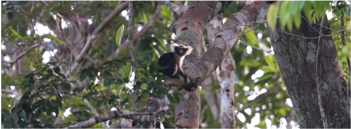
Santarem Marmoset

Another marmoset that can be difficult to locate but after a longish morning ashore exploring around the village of Canumã (19 May) we were rewarded with some fantastic views of this handsome primate.