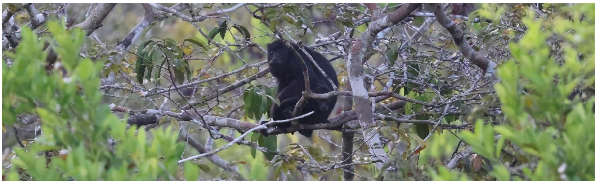
Amazon Black Howler © Chris Collins May 2024

This species is found north of the Amazon and east of the Rio Negro with the first sightings being from the Musa Tower in the protected forest north of Manaus on 15 May. Our itinerary meant we were then only back in range for this species towards the end of the voyage with more seen along the Erepecuru River on 25 May.