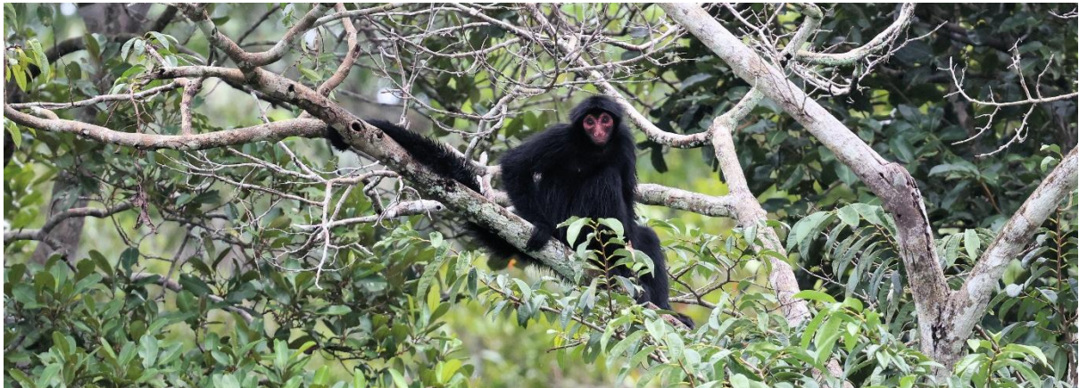
Red-faced Black Spider Monkey May 2024

One of the last primates of the voyage and found at Alter do Chaõ on the last full day aboard Iracema (27 May).