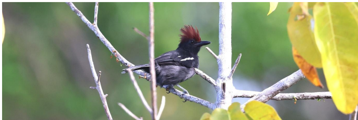
Glossy Antshrike May 2024