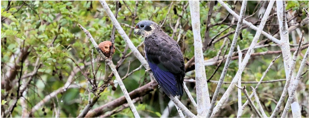
Dusky Parrot © Chris Collins May 2024