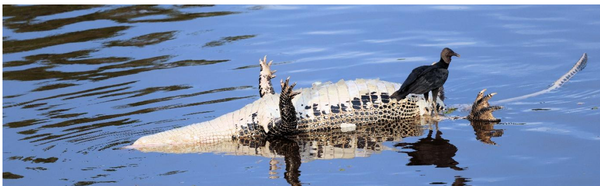
Black Vulture on caiman corpse © Chris Collins May 2024

White-tipped Dove Leptotila verreauxi Grey-fronted Dove Leptotila rufaxilla Grey-cowled Wood Rail Aramides cajaneus Purple Gallinule Porphyrio martinica Limpkin Aramus guarauna Black-necked Stilt Himantopus mexicanus Pied Plover Hoploxypterus cayanus Southern Lapwing Vanellus chilensis Collared Plover Anarhynchus collaris Wattled Jacana Jacana jacana Black Skimmer Rynchops niger Yellow-billed Tern Sternula superciliaris Large-billed Tern Phaetusa simplex Sunbittern Eurypyga helias Anhinga Anhinga anhinga Neotropic Cormorant Nannopterum brasilianum Buff-necked Ibis Theristicus caudatus Green Ibis Mesembrinibis cayennensis Rufescent Tiger Heron Tigrisoma lineatum Boat-billed Heron Cochlearius cochlearius Black-crowned Night Heron Nycticorax nycticorax Capped Heron Pilherodius pileatus Little Blue Heron Egretta caerulea Snowy Egret Egretta thula Striated Heron Butorides striata Great Egret Ardea alba Western Cattle Egret Ardea ibis Cocoi Heron Ardea cocoi Hoatzin Opisthocomus hoazin King Vulture Sarcoramphus papa