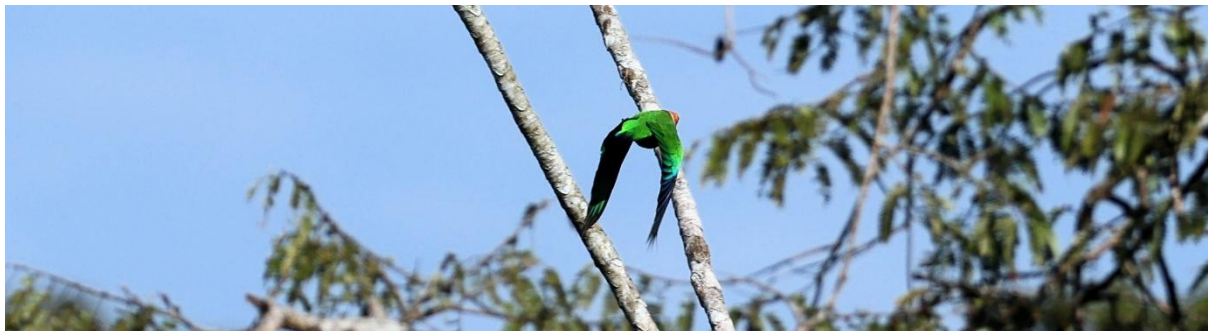
Bald Parrot © Chris Collins May 2024

Bar-breasted Piculet Picumnus aurifrons Yellow-tufted Woodpecker Melanerpes cruentatus Little Woodpecker Veniliornis passrinus Golden-collared Woodpecker Veniliornis cassini Spot-breasted Woodpecker Colaptes punctigula Waved Woodpecker Celeus undatus Chestnut Woodpecker Celeus elegans Cream-coloured Woodpecker Celeus flavus Ringed Woodpecker Celeus torquatus Lineated Woodpecker Dryocopus lineatus Crimson-crested Woodpecker Campephilus melanoleucos Black Caracara Daptrius ater Red-throated Caracara Ibycter americanus Crested Caracara Caracara plancus Yellow-headed Caracara Milvago chimachima Laughing Falcon Herpetotheres cachinnans Bat Falcon Falco ruficularis Peregrine Falco peregrinus Tui Parakeet Brotogeris sanctithomae White-winged Parakeet Brotogeris versicolurus Golden-winged Parakeet Brotogeris chrysoptera