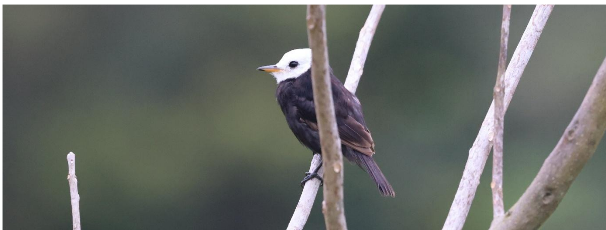
White-headed Marsh Tyrant May 2024

White-headed Marsh Tyrant Arundinicola leucocephala Rusty-margined Flycatcher Myiozetetes cayanensis Social Flycatcher Myiozetetes similis Amazonian Inezia Inezia subflava Great Kiskadee Pitangus sulphuratus Lesser Kiskadee Philohydor lictor Streaked Flycatcher Myiodynastes maculatus White-throated Kingbird Tyrannus albogularis Tropical Kingbird Tyrannus melancholicus Fork-tailed Flycatcher Tyrannus savana Short-crested Flycatcher Myiarchus ferox Cinnamon Attila Attila cinnamomeus White-eyed Attila Attila bolivianus (H) Bright-rumped Attila Attila spadiceus (H) Capuchinbird Perissocephalus tricolor Screaming Piha Lipaugus vociferans (H) Spangled Cotinga Cotinga cayana Bare-necked Fruitcrow Gymnoderus foetidus Blue-backed Manakin Chiroxiphia pareola White-bearded Manakin Manacus manacus White-crowned Manakin Pseudopipra pipra Crimson-hooded Manakin Pipra aureola Red-headed Manakin Ceratopipra rubrocapilla Black-tailed Tityra Tityra cayana Masked Tityra Tityra semifasciata White-winged Swallow Tachycineta albiventer Brown-chested Martin Progne tapera Grey-breasted Martin Progne chalybea Southern Rough-winged Swallow Stelgidopteryx ruficollis Barn Swallow Hirundo rustica Black-capped Donacobius Donacobius atricapilla Thrush-like Wren Campylorhynchus turdinus