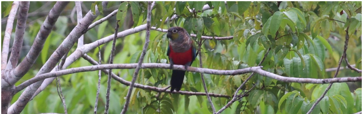
Crimson-bellied Parakeet © Chris Collins May 2024

Crimson-bellied Parakeet Pyrrhura perlata Painted Parakeet Pyrrhura picta Peach-fronted Parakeet Eupsittula aurea Red-bellied Macaw Orthopsittaca manilatus Blue-and-yellow Macaw Ara ararauna Chestnut-fronted Macaw Ara severus Scarlet Macaw Ara macao Red-and-green Macaw Ara chloropterus