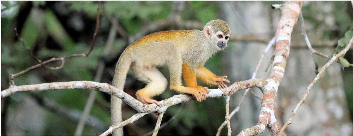
Humboldt's Squirrel Monkey

Found south of the Amazon and Solimoes Rivers and seen on two dates (17-18 May).