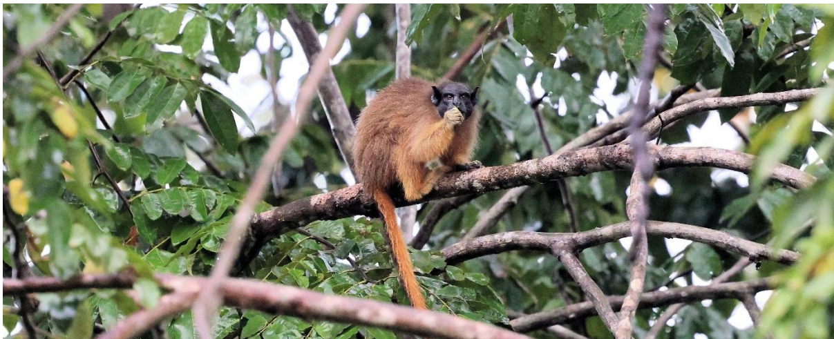
Martins's Bare-faced Tamarin

A family group of six or so individuals was seen from the Musa Tower on the outskirts of Manaus on 15 May.