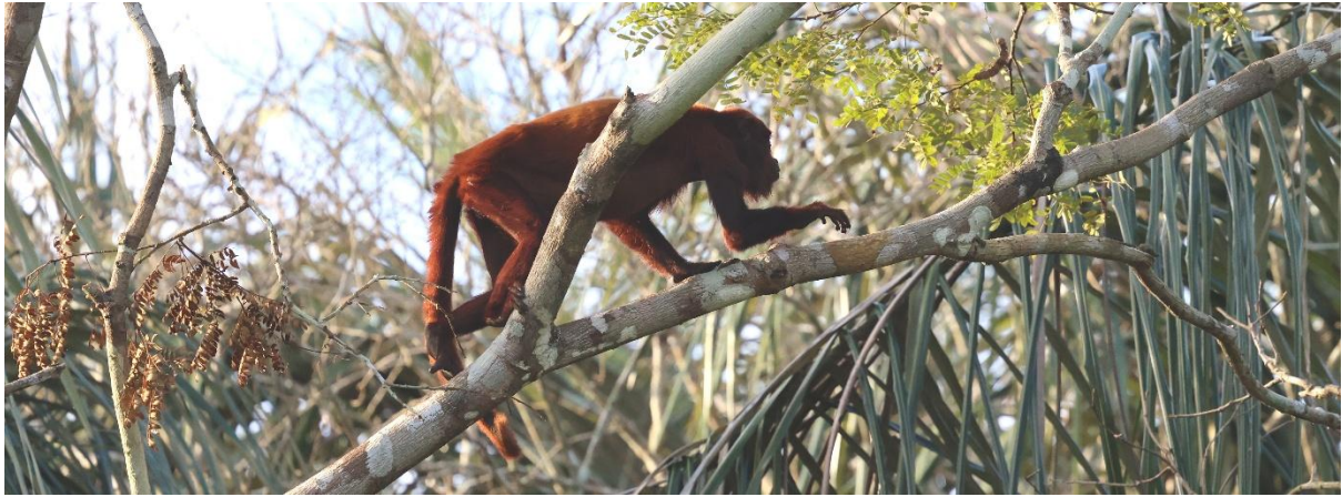
Colombian Red Howler

This species is found west of the Rio Negro so we were only in range at the very beginning of the voyage and it was found at Xiboreninha on 16 May.