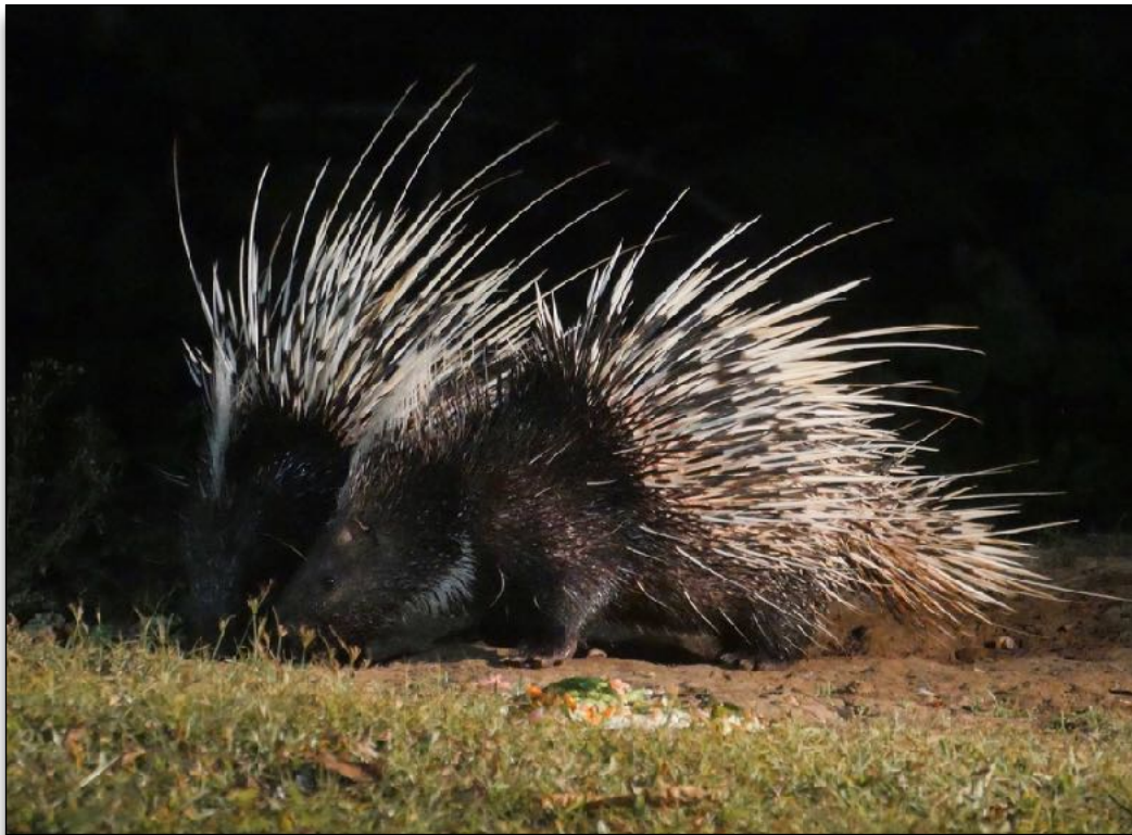
Malayan Porcupine

Malayan Porcupine Hystrix brachyura - Up to six a night during our stay in KY , sometimes even in the restaurant.