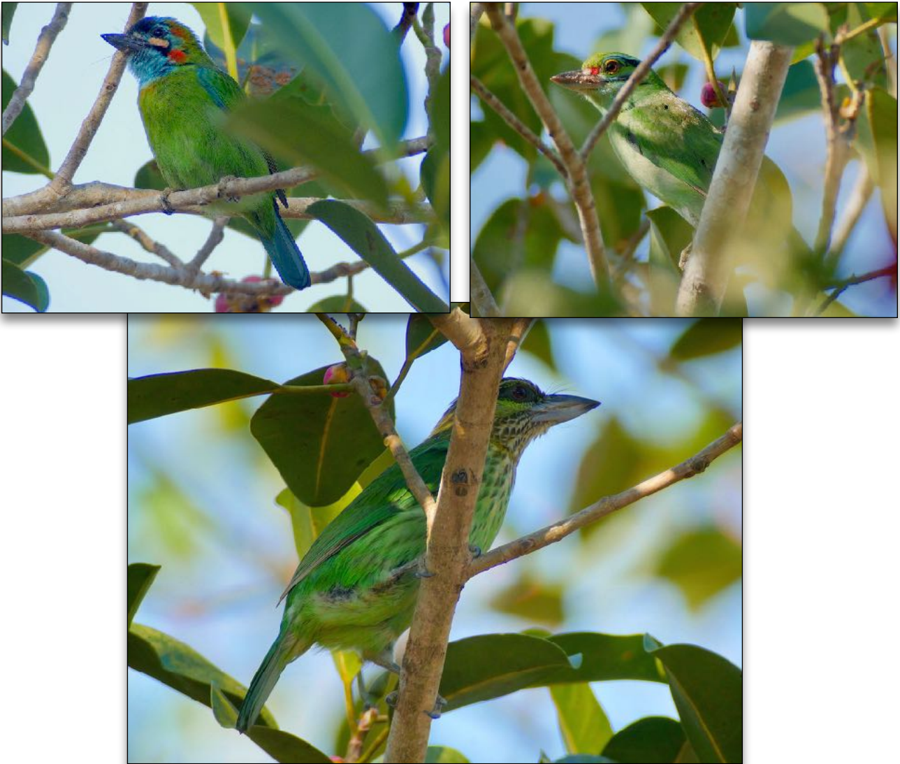
Blue-eared, Moustached and Green-eared Barbet

Blue-eared Barbet M. australis - Several seen well at KY on 22/01 and heard daily. Two at KK on 29/01.