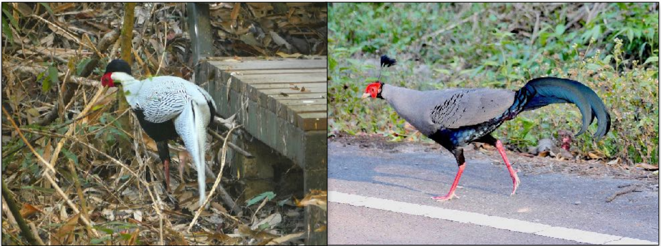
Male Silver Pheasant and Siamese Fireback

Grey Peacock Pheasant Polyplectron bicalcaratum – A frustratingly close male several times calling at one of the waterholes where we were sat in a hide sadly refused to show itself 28/02 KK