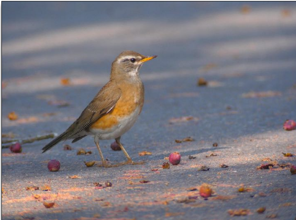
Eyebrowed Thrush

Eye-browed Thrush Turdus obscurus – Two, KY 22/01, one KY 25/01 and one KK 28/01.