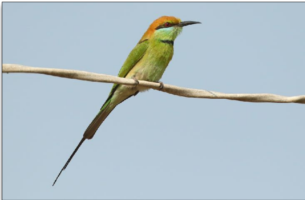
Green Bee-eater ©Jonathan Mercer.

Green Bee-eater Merops orientalis – Small numbers in the LPB/PK area.