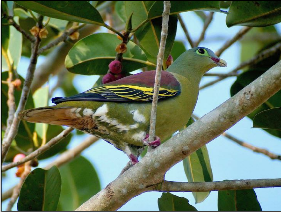
Thick-billed Pigeon

Wedge-tailed Green Pigeon T. sphenura – Several at KK on 29/01 and at SPN on 01/02.