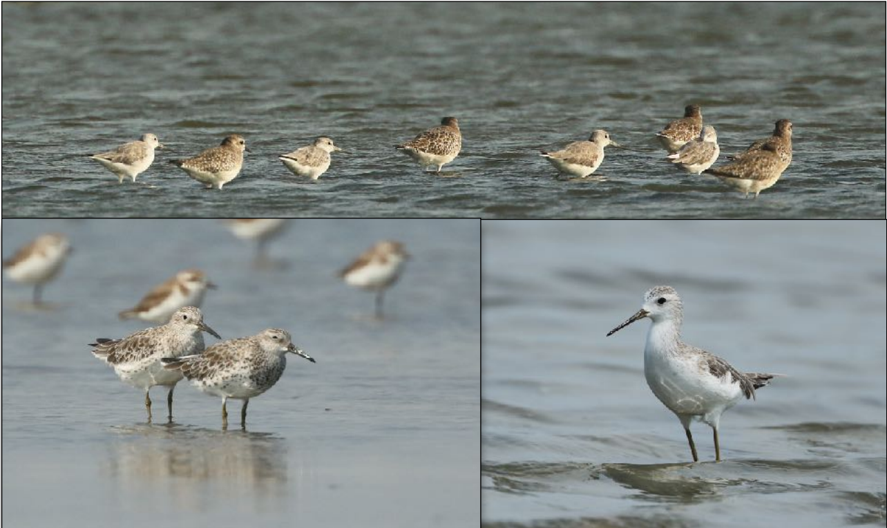
Nordmann's Greenshank with Grey Plover, Great Knot & Marsh Sandpiper © Jonathan Mercer.

Nordmann's Greenshank Tringa guttifer - Good views were obtained with a maximum count of around 76 birds together at LPB/PT on 27/01.