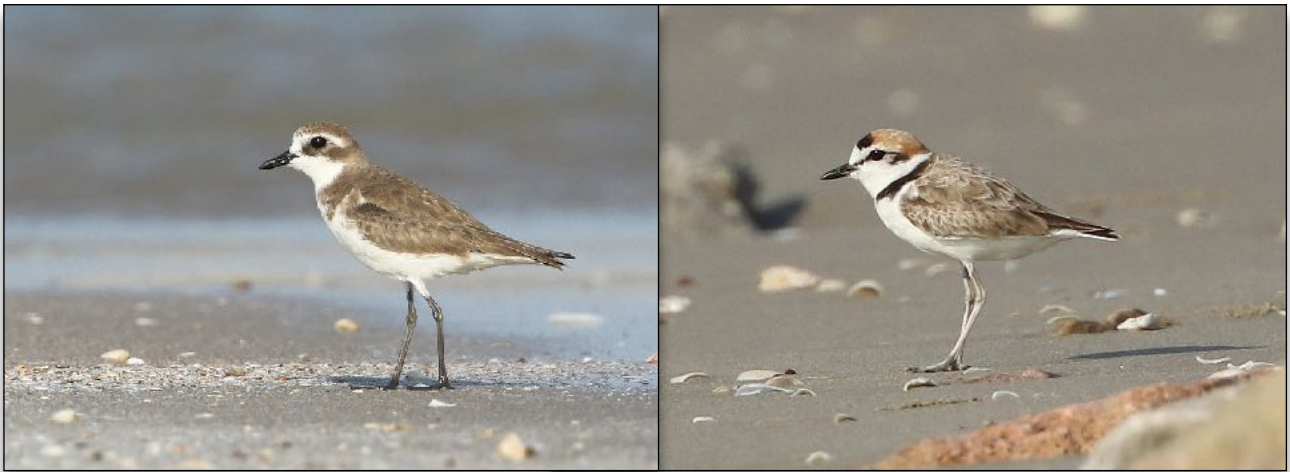
Lesser Sandplover and Malaysian Plover.

Bar-tailed Godwit L. lapponica - At least thirty birds near LPB on 27/01.