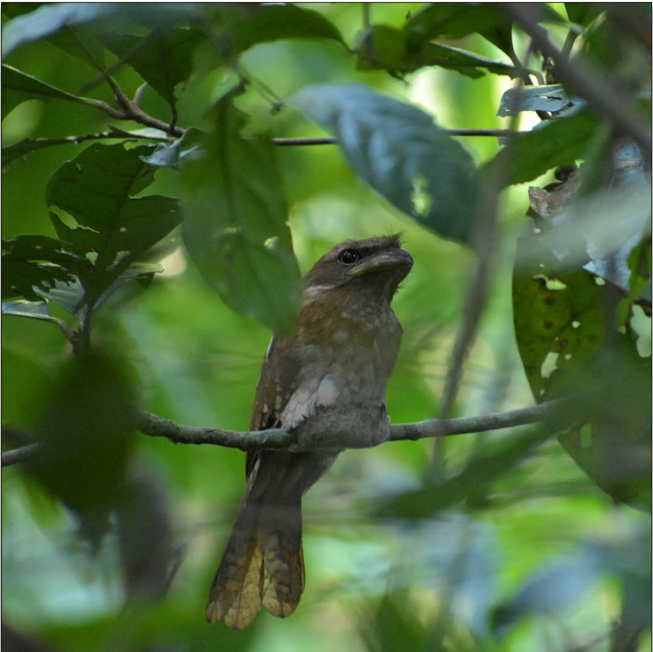
Blyth's Frogmouth

Great-eared Nightjar Eurostopodus macrotis - Singles on 22/01, 23/01, two on 24/01 and one 25/01 at KY and two on 29/01 KK .