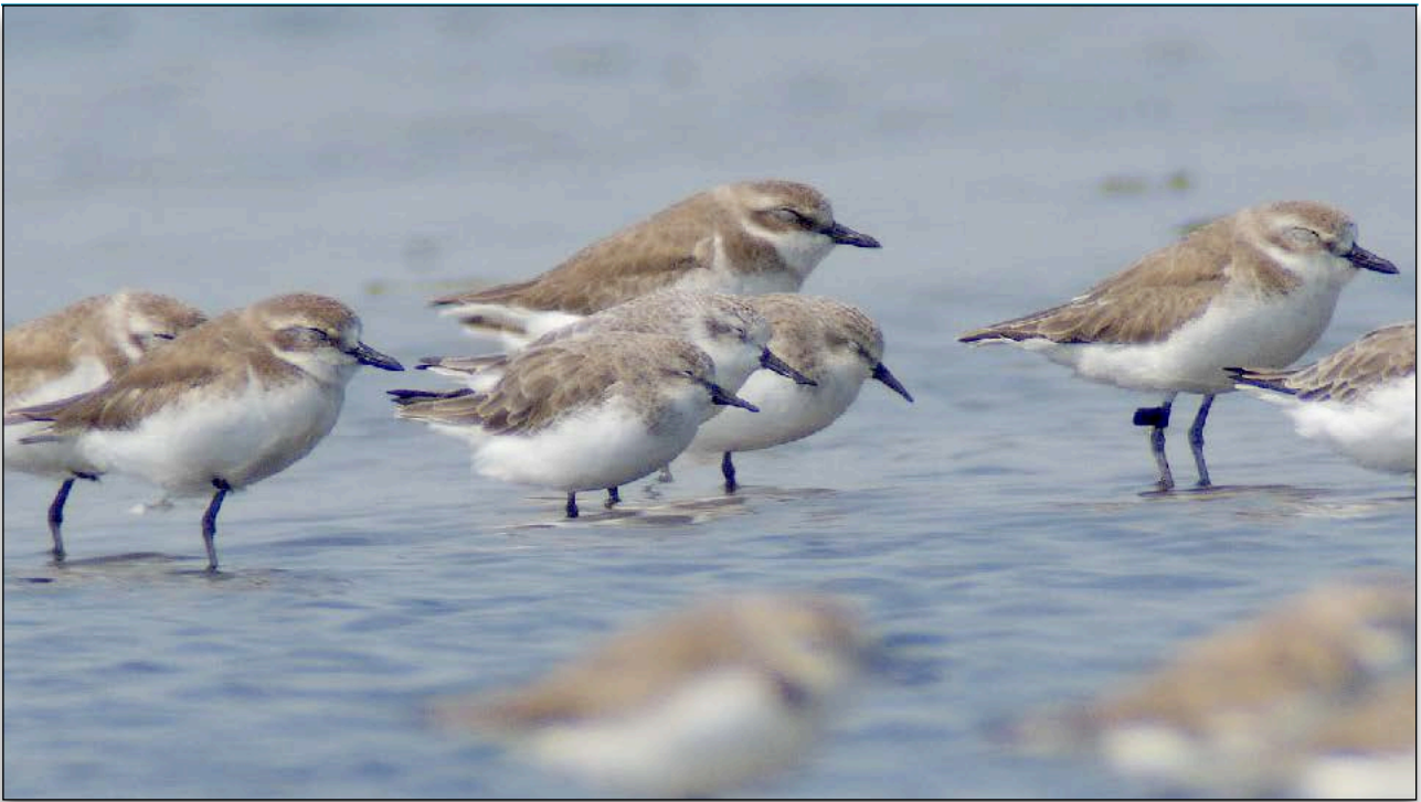
Spoon-billed Sandpiper roosting

Asian Dowitcher Limnodromus semipalmatus – A group of Eighty two birds together LPB on 27/01.