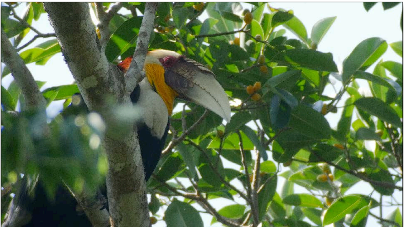
Wreathed Hornbill

Wreathed Hornbill A. undulatus – A pair at KY on 22/01, females on 23/01 & 24/01. Four on 05/01 and at SPN on 02/02 & 03/02.