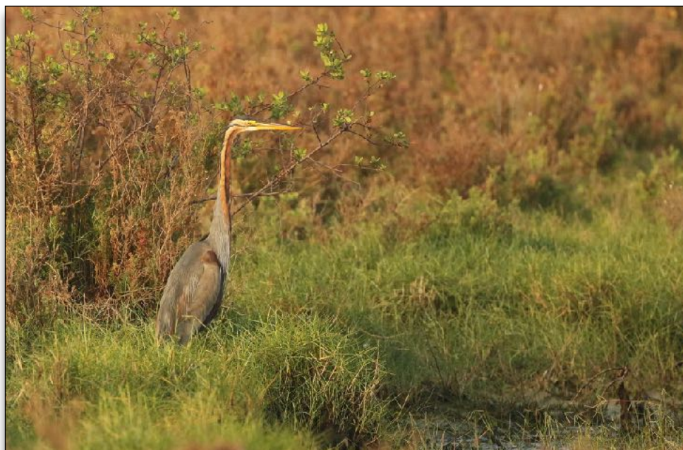
Purple Heron

Purple Heron Ardea purpurea –Two, HCS 28/01.