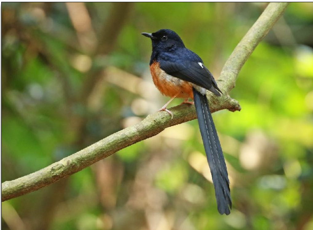
White-rumped Shama

Brown-streaked Flycatcher M. williamsoni - One SPN on 02/02.