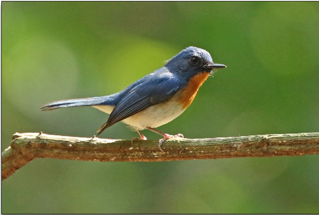
Indochinese Blue Flycatcher

Slaty-backed Forktail E. schistaceus - One KY on 22/01.