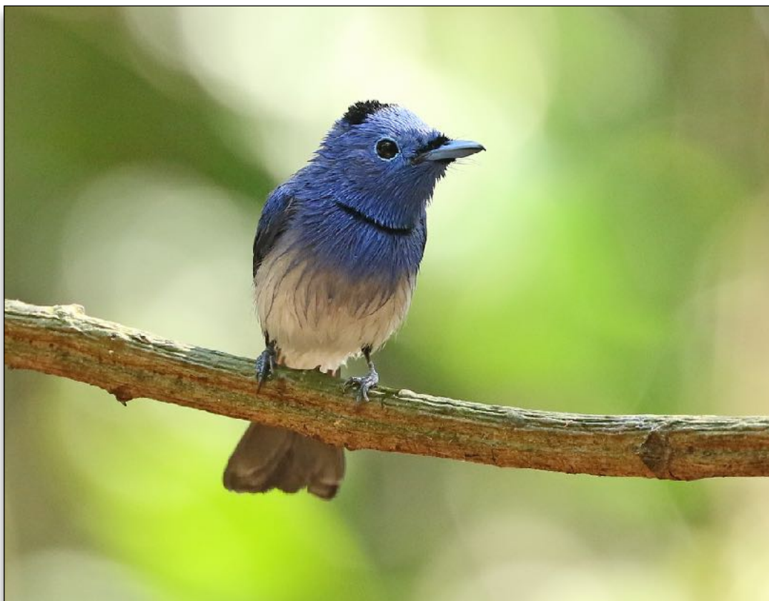
Black-naped Monarch

Black-naped Monarch Hypothymis azurea – Regularly observed at both KY and KK .