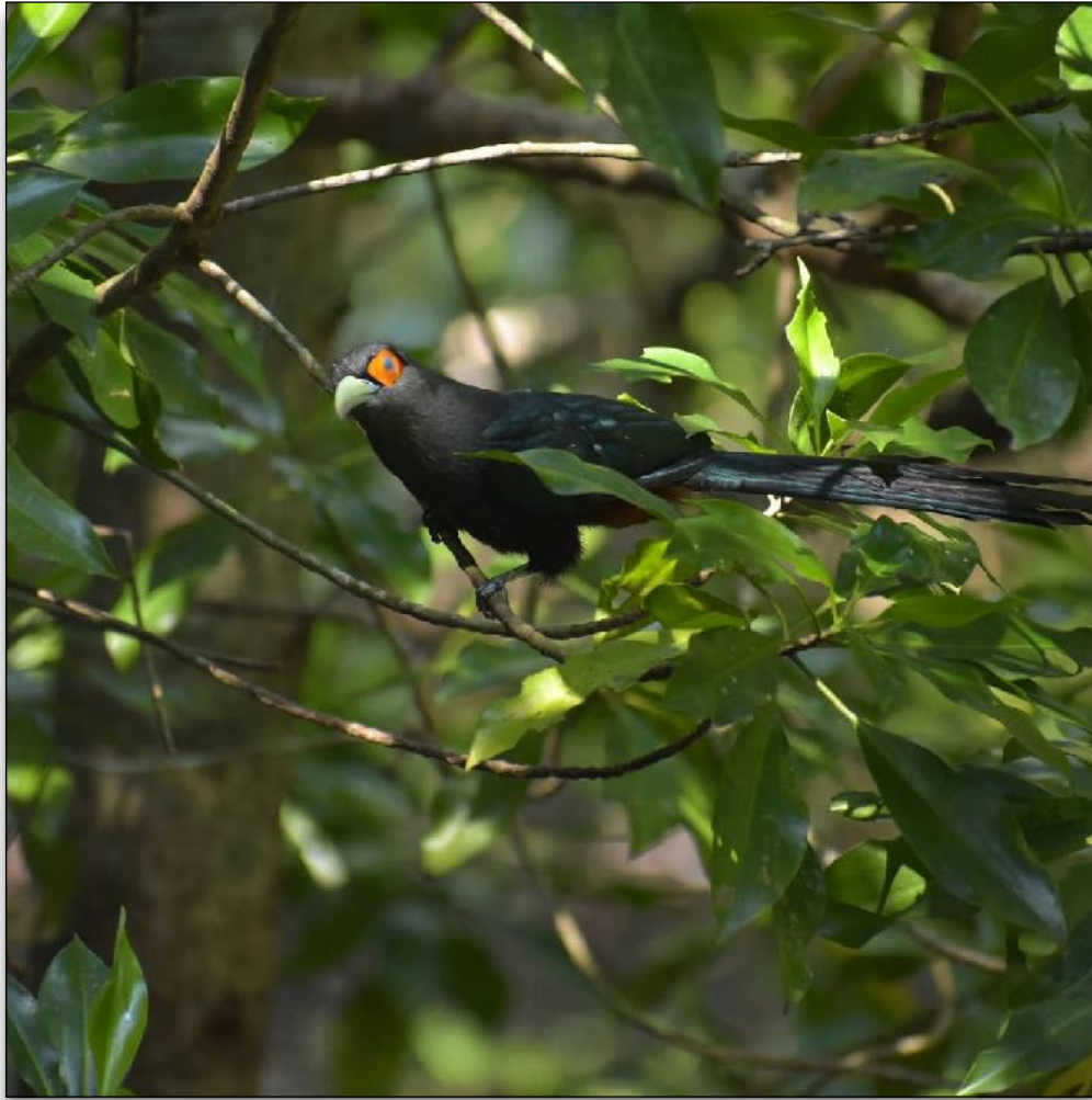
Chestnut-bellied Malkoha

Chestnut-bellied Malkoha P. sumatranus - Observed at SPN on 02/02.