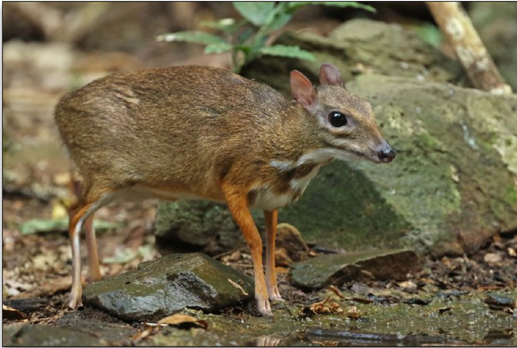
Greater Mousedeer

Red Muntjac Muntiacus muntjak – Observed daily at KY .