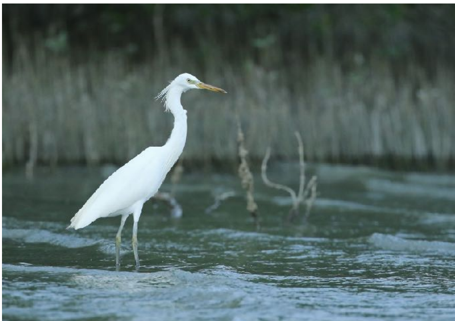
Chinese Egret

Chinese Egret Egretta eulophotes – Two, Laem Pak Bia Sandspit 26/01.