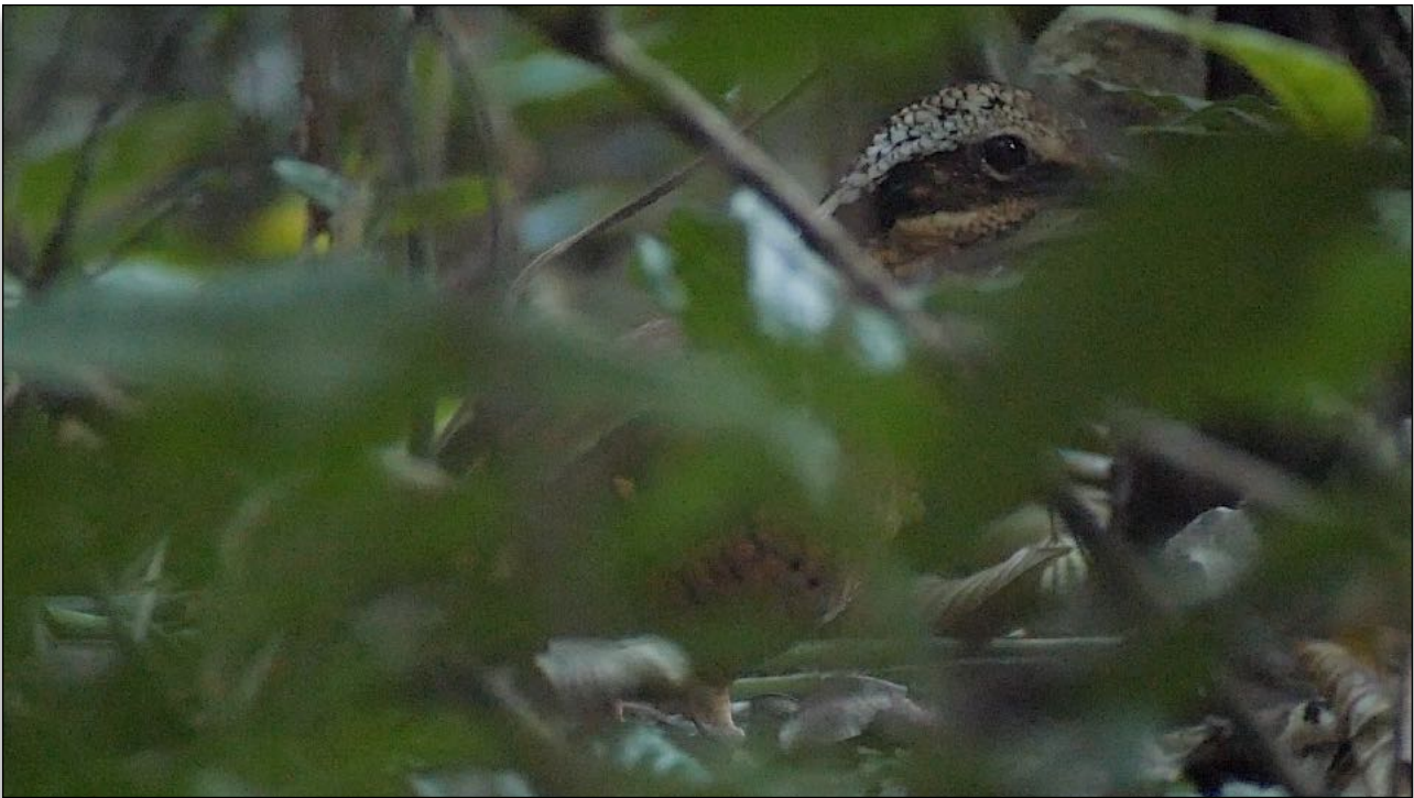
Eared Pitta watching from the undergrowth shadows (video still)

Malayan Banded Pitta Hydrornis irena - Heard at SPN on the 02/01 and male observed moving across a trail on 03/02 at SPN.