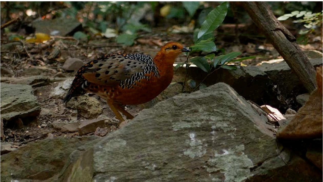
Ferruginous Partridge