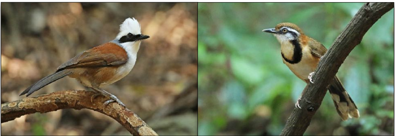
White-crested and Lesser-necklaced Laughingthrush

Lesser-necklaced Laughingthrush Garrulus monileger – Heard at KY 22/01, one KY 23/01 and a group in KK 28/01.