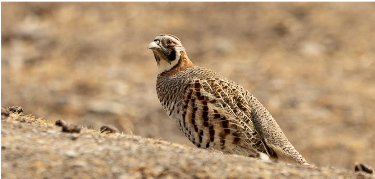
Tibetan Partridge

The fields around the village were still partly covered in snow, but in the shelter of one terraced wall, we had our first sightings of delightful and intricately patterned Tibetan Partridges – we recorded 35 during the day, and took very many photographs. Definitely one of the birds of the trip, and a species that we saw on almost every day in Hemis, often from, or close to our watchpoint.