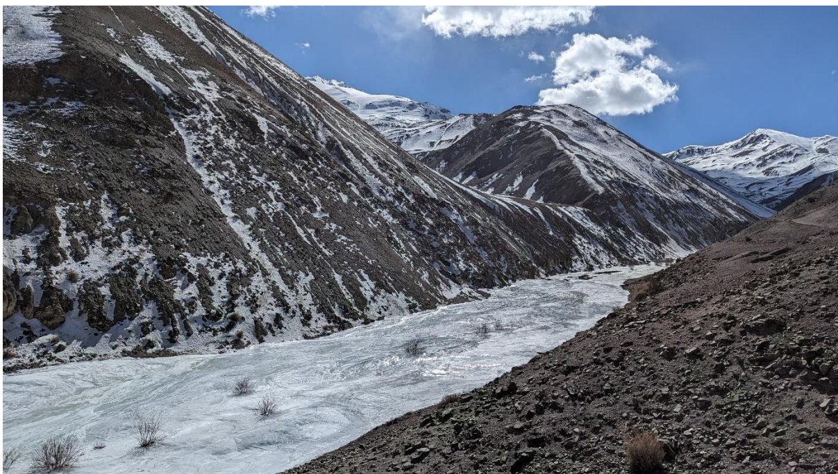
Views close to WildWings Snow Leopards camp

Meanwhile, I had commented that the fields just below the house had a couple of new buildings at their edge, and the shape of these structures suggested they were toilets. It was explained to us that they were indeed just that. For the past two summers, perhaps for the first time in living memory, the stream had not enough water to irrigate the fields. Furthermore, this was the trekking route that people took over a nearby pass, and that the campground higher up was now totally dry, and there was no flowing water in the stream up there in the summer. The owners of the house, unable to grow crops, had decided to turn their fields into a campground, and hope that the limited water resource would be enough for the trekkers. Apparently, it had been so far, but we knew that they must have been praying that it would continue that way.