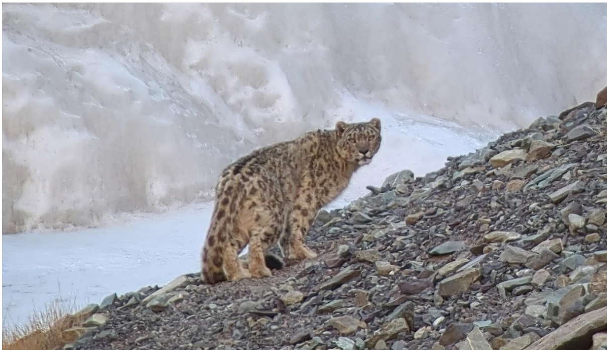
Snow Leopard

Our lunch arrived, and then afternoon tea. The slight heat shimmer of the middle of the day diminished. The Snow Leopards moved a few metres to a spot where the icefall of the stream was the backdrop. This was surely the best yet and we watched with renewed interest and took yet more pictures. Who could resist, and besides, we needed them to be totally insufferable to all our friends when we got home.