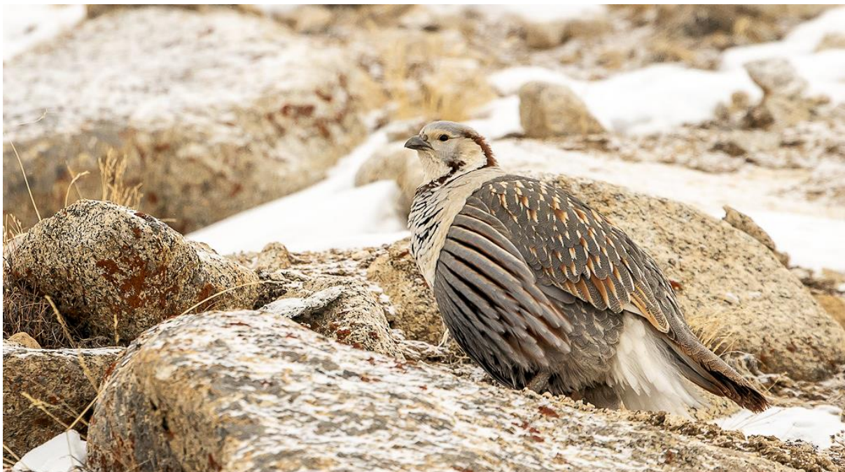
Himalayan Snowcock

After breakfast, we set off up the valley towards Urutse, aiming to have lunch where two the valleys join, and hoping to relocate the tracks of a female Snow Leopard and her two well grown cubs that one of the spotters had found earlier. He had not seen the animals themselves, but there must be a chance, and besides, it would be wonderful to see the tracks if we could find them.