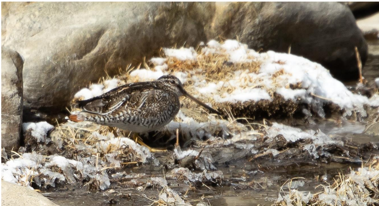
Solitary Snipe

The snipe gave us prolonged and excellent views. Later on, and closer to Leh, we stopped to look for Brown Dipper, finding two, with the bonus of a lovely feeding group of Red-fronted Serins, including some striking males.