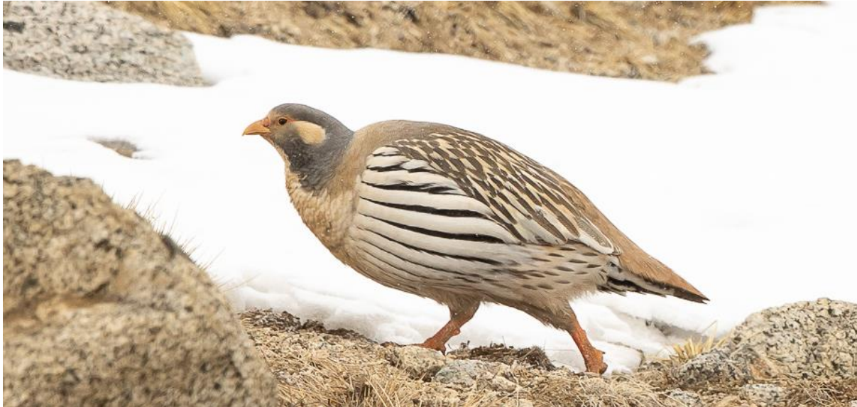
Tibetan Snowcock

Heading over to another pass nearby, we were eventually able to get splendid views of two Tibetan Snowcock, even closer to the van than the Himalayans had been. The birds were quietly feeding just a few metres away, with a splendid backdrop of the snow-covered peaks and north-facing slopes of Hemis National Park in the distance on the other side of the also now distant Indus valley far below us.