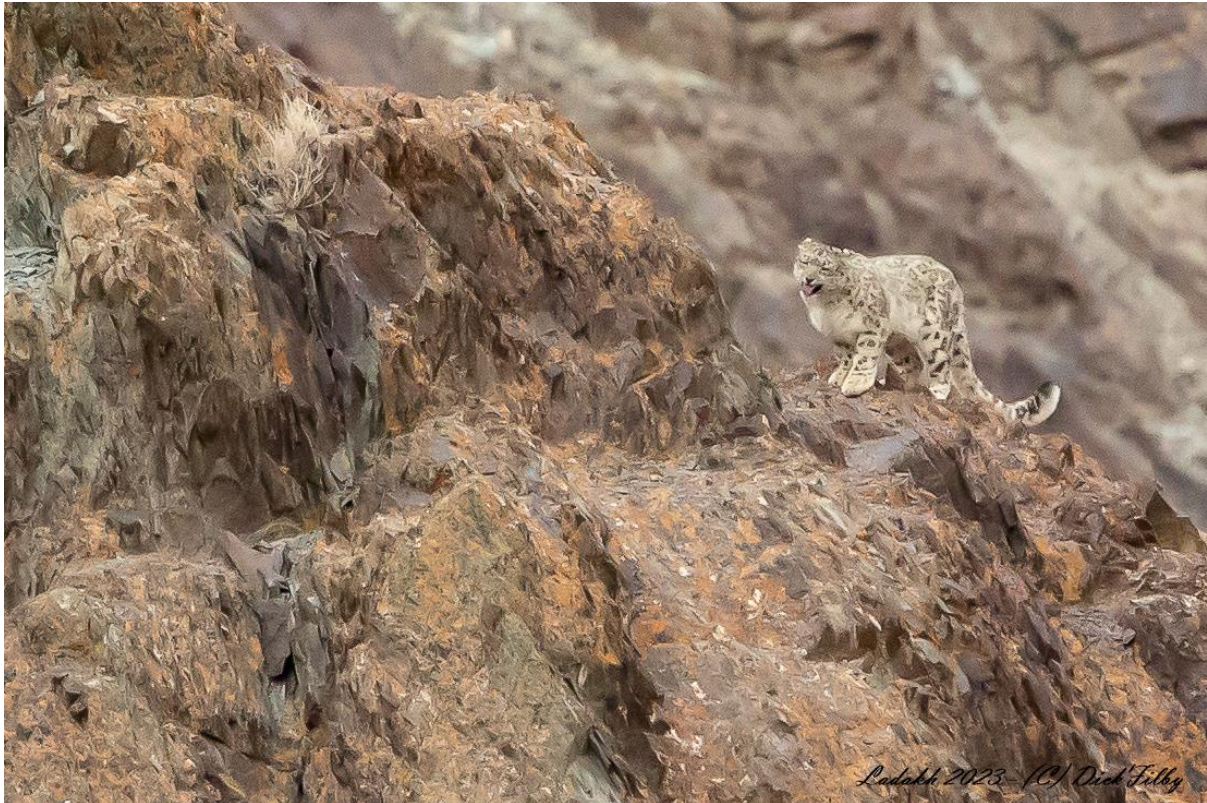
Snow Leopard

The rest of camp showed up, summoned by the radio. It took only a few minutes for them to scurry downhill to join us and we were all enjoying this now. Snow Leopard #1 was now descending, coming down towards us, obviously intent on meeting up with the other one. Were they competing males, or a pair in the making, or even competing females? We could not tell. #1 came lower still, disappearing from view before reappearing ever closer. It was now below us, less than 150 metres away.