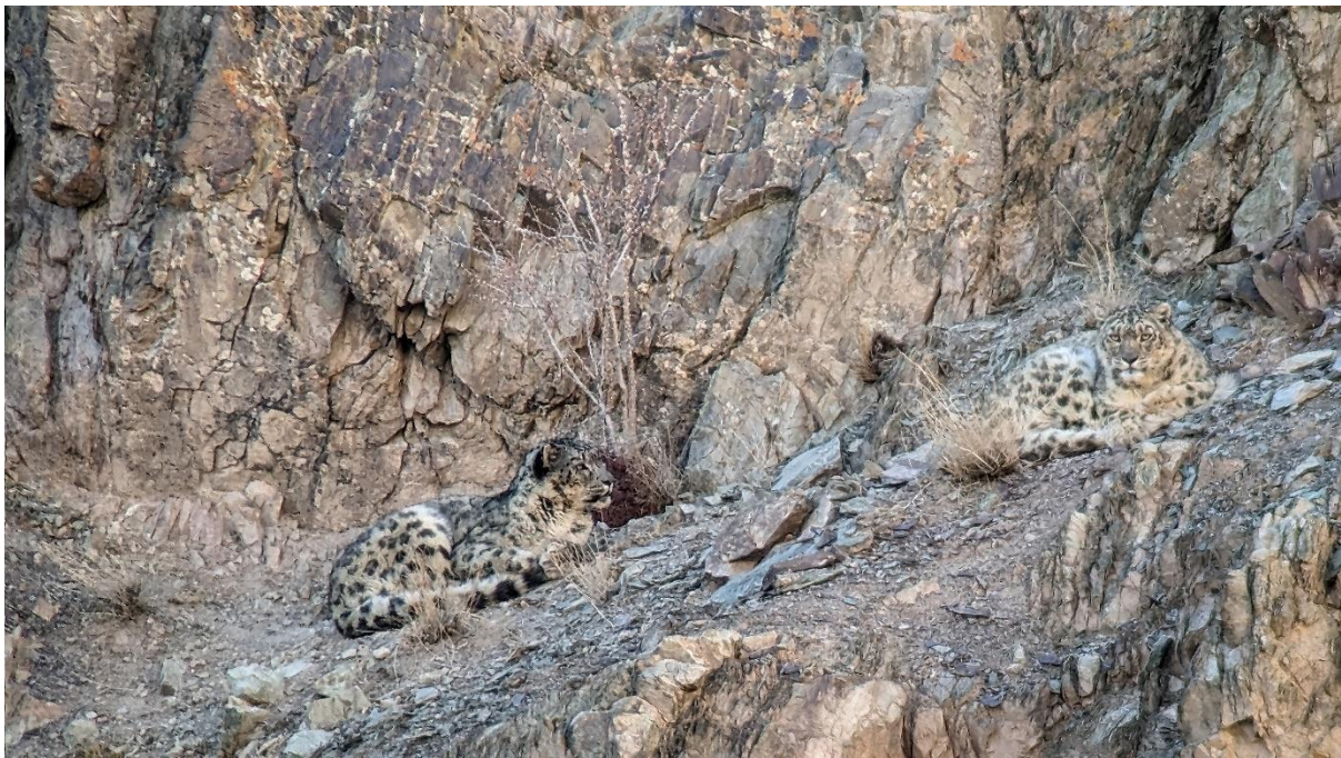
Snow Leopards

Well, it did not take long to relocate the pair of Snow Leopards this morning. They had scarcely changed position overnight, so we were again watching them well before breakfast, and once again, they were pretty active. Today, we needed to hike a little up the hill to watch them, as they had moved a little, so we were on the hillside some 50 metres above the track. We found a comfortable spot and settled in.