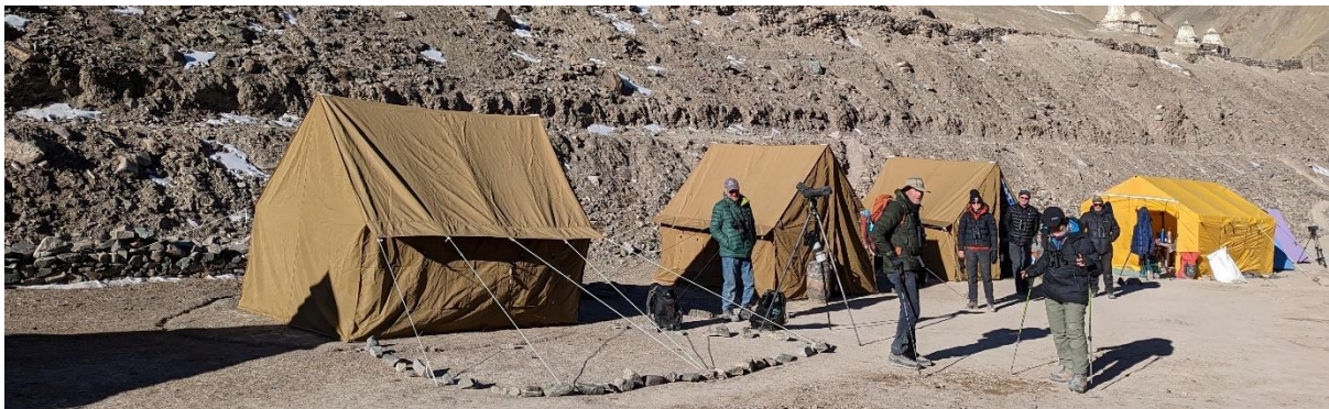
WildWings Snow Leopards camp

Well, we had watched Snow Leopards for prolonged durations on an incredible seven of our first ten days and there was no sense of disappointment at the watchpoint before breakfast when this morning we were not rewarded with Snow Leopard views. Indeed, we took an early breakfast in camp and set off on a gentle stroll up-valley, with our destination being the highest outlying house in the entire district.