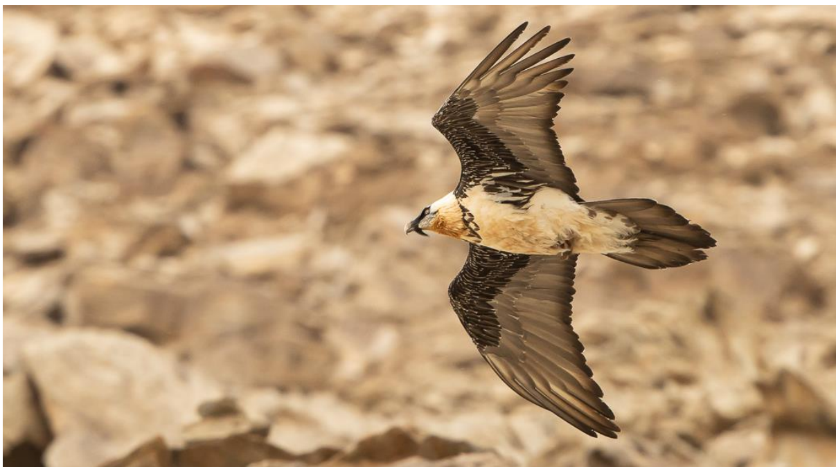
Bearded Vulture (Lammergeier)

The plan for the afternoon was to drive down to the river Indus and look for the extraordinary Ibisbill, a monotypic species that occurs only on the mountain rivers of east central Asia. In the past, we have often seen them from the vehicle, or by walking just a few yards: very little exercise involved. Well, best made plans and all that.. I knocked on doors and encouraged everyone to come to lunch with the news that instead of a drive to look for roadside Ibisbills, we were instead driving to look for roadside Snow Leopards! And just an hour and a half after setting off, we were doing just that! It was a thrilling few hours, as we watched the two Snow Leopards, a male and a female, at eye level across the stream, giving us great views including the ultimate in voyeurism.