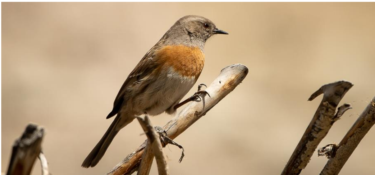
Robin Accentor

In between, the male kept a watchful and attentive eye on the female, waiting for the sign that she was receptive. Several times it would seem that he was about to advance, and then he realised that the signals were "no, not right now Mr", so he respectfully lay down again and resumed his patient attentiveness.