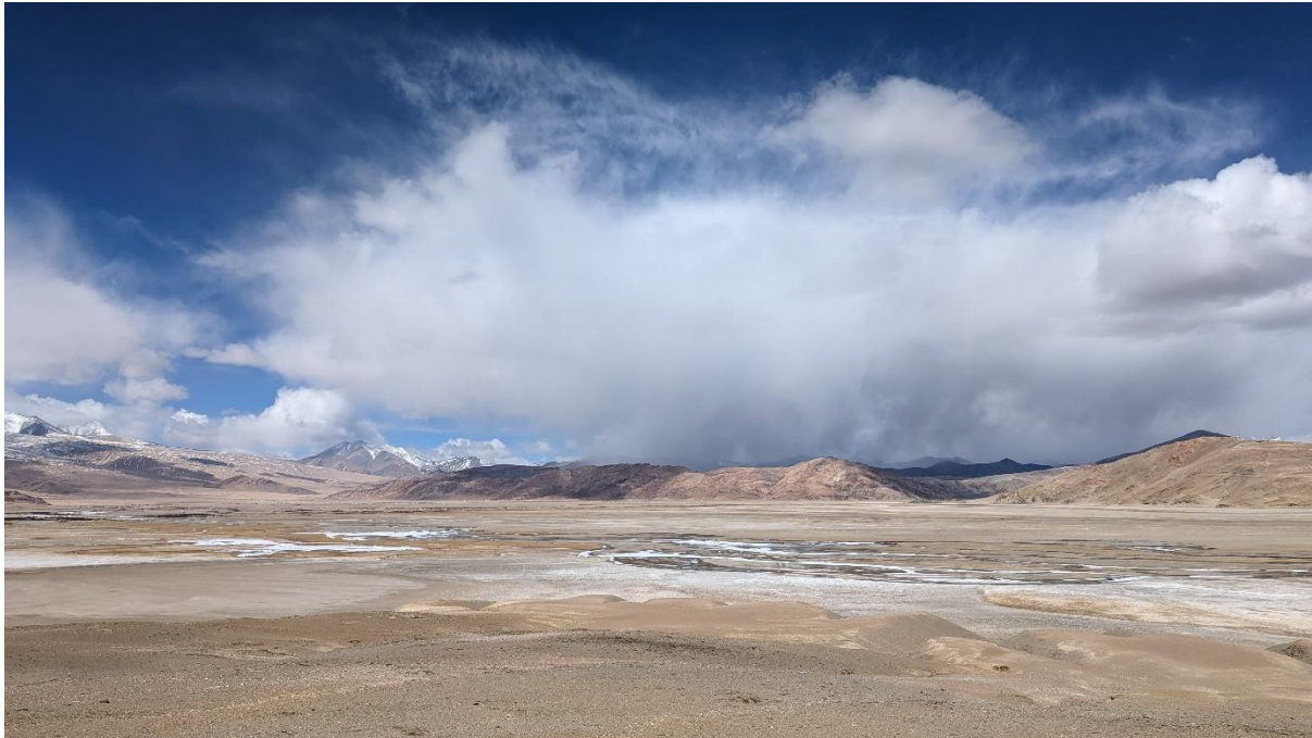
Pallas's Cat habitat

Kiang were omnipresent near the Indus. We continued our search for Pallas's Cat and were rewarded with not one but two Tibetan Foxes – it seems this species is not always hard to see!