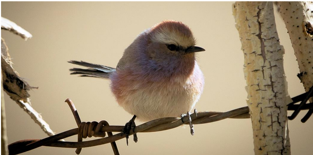
White-browed Tit-warbler

It was only 500 metres or so to the mouth of the gorge, and we paused to scan. There was nothing other than Blue Sheep, so we continued and almost immediately one of the best birds of the trip came flitting past us – a stunning blue, purple and turquoise male White-browed Tit-warbler. Andrew, Steve and I followed it for a few yards up the valley and we got great views and even some photos. This is not easy for this species, as the birds are typically very active and keep on the move. Some years we see several, but this was to be the only one of the trip.