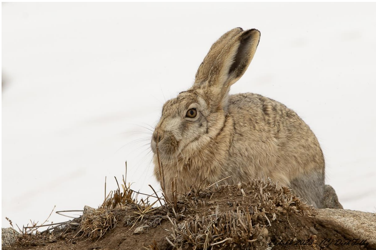
Woolly Hare