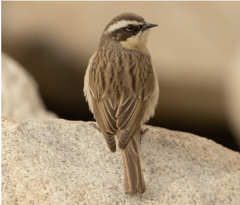
Brown Accentor

Rosefinches and whilst some were hard to get proper views of, at least two were Streaked Rosefinches, and we considered that they may well have all been that species.