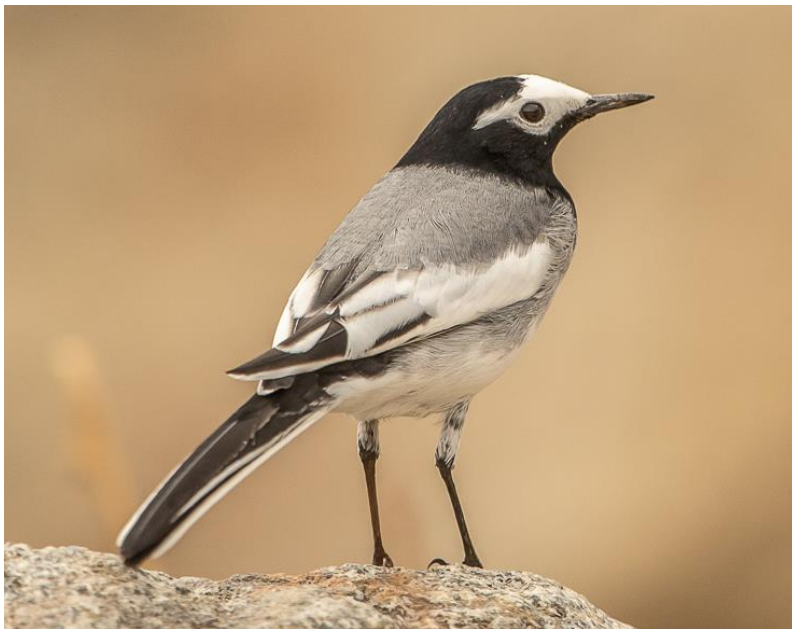
White Wagtail (masked form)

We watched it at leisure for the next hour as it fed in front of us, giving superb views, with a backdrop of scores of colourful Güldenstädt's Redstarts festooning the riverside bushes like Christmas decorations.