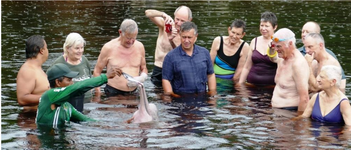
‘Dolphin swim’, near Manaus

For many of the group, one of the major highlights of the entire trip was ‘swimming’ with some wild dolphins at a white sand beach not far from Manaus. Although the dolphins are given a couple of kilos of fish, they stayed with us long after all the fish had been eaten and it was a truly magical experience interacting with them.