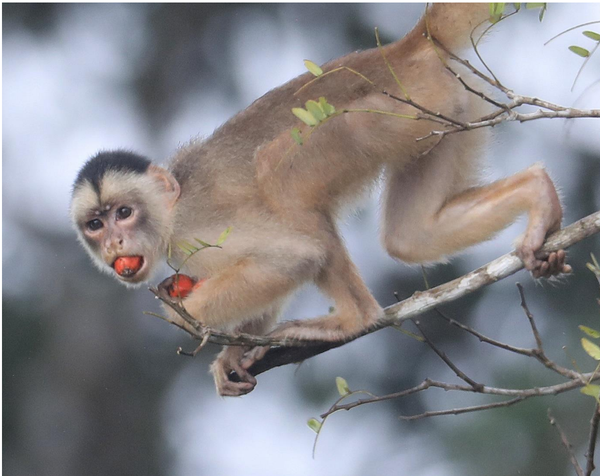
Spix's White-fronted Capuchin

The final sightings were about three individuals which were seen on 5 May whilst exploring the Amana River.