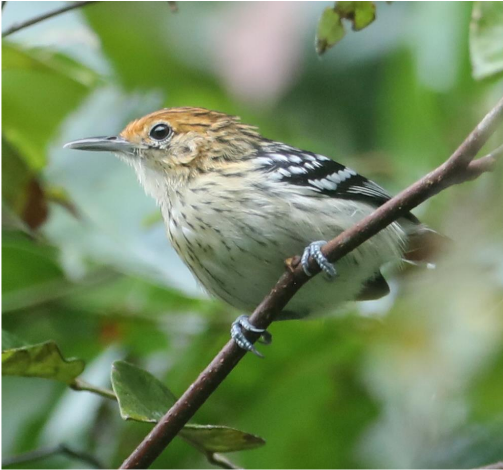
Amazonian Streaked Antwren (female)