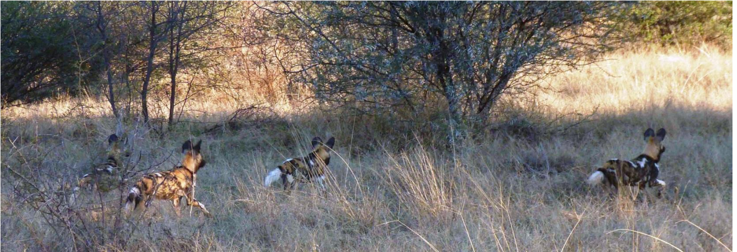
African Wild Dogs (Mervyn Griffin)