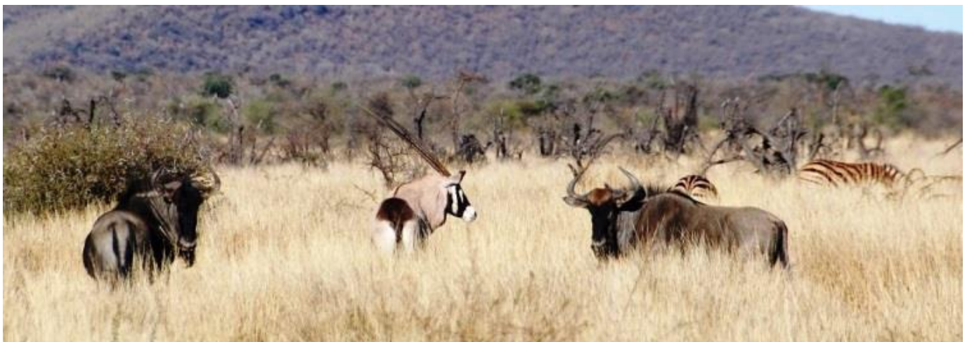
Blue Wildebeest, Gemsbok & Plains Zebra (Fiona McHugh)

We spent a couple of hours in the plains in the extreme west of the park but despite a considerable amount of effort were unable to locate any tsessebe although a small group of Red Hartebeest did create momentary excitement. However it was still a very enjoyable morning due to the large numbers of Plains Zebra and Blue Wildebeest in the area. We also had at least three Gemsbok , 18+ Zambezi (Greater) Kudu and five Eland demonstrating the richness of the western part of the park for ungulates. The drive back to the lodge for breakfast produced another two female White Rhinos with calves.