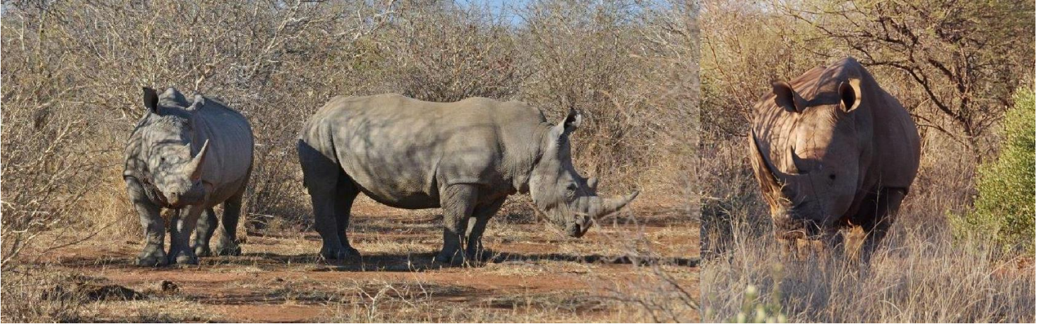
White Rhinos (Anita Lloyd / Fiona McHugh)

After showering, packing and having breakfast we said goodbye to Benson and the other lodge staff. A waterhole full of Plains Zebra along with a handful of African (Bush) Elephants was a nice finale as we headed to the gate.