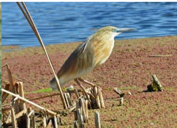
Squacco Heron (Anita Lloyd)

The numbers of birds were also down presumably due to the weather, a view shared by local birders that Kevin spoke to. However we still saw a good variety of species including including African Spoonbill, Intermediate (Yellow-billed) Egret, Black-headed, Goliath, Purple, Squacco and Black-crowned Night Herons although we failed to find the Slaty Egret that had been seen earlier in the morning. Wildfowl included Southern Pochard, Cape Shoveler and both Hottentot and Red-billed Teal while waders included Three-banded, Blacksmith and Crowned Plovers, African Wattled Lapwing, African