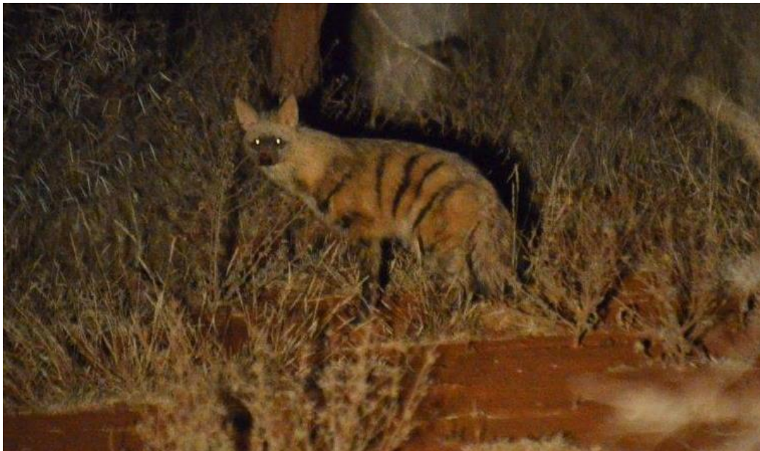
Aardwolf

We had a belated sundowner before heading back towards the lodge only to find the most obliging Aardwolf of the trip, and probably of the four tours to date, posing for us on the way back. We arrived back at the lodge thoroughly delighted with our final afternoon/evening drive.