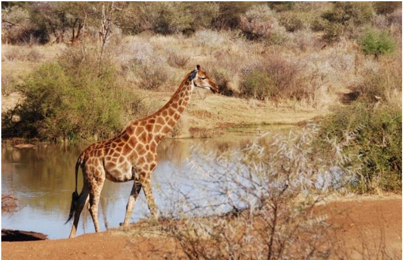
South African Giraffe (Fiona McHugh)

During the short gaps between breakfast, lunch and high tea we either rested or birded the lodge grounds and Nile Crocodile, Water Monitor and several Striped Skinks were all encountered while the river crossing was visited by a procession of ungulates.