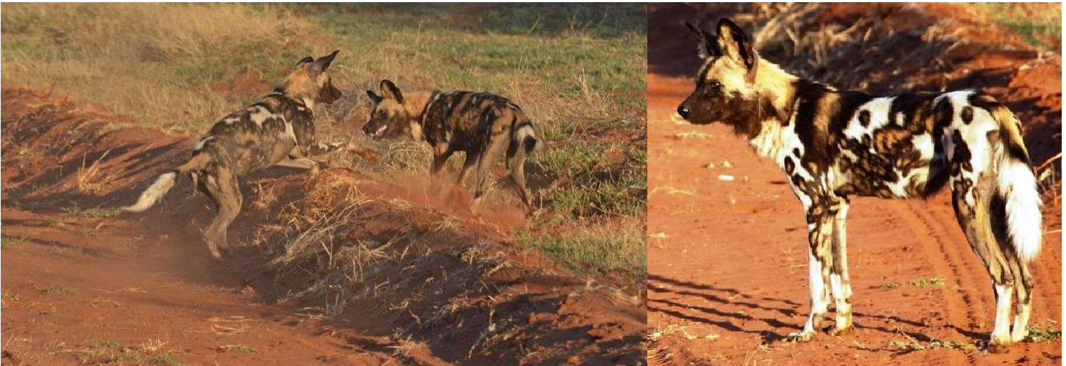
African Wild Dogs (Anita Lloyd/Fiona McHugh)

We headed out into the park and on reaching the main track had nice views of an African Wildcat which showed much better than the one the night before. We then headed off for the southern boundary of the park and shortly after first light found another Brown Hyaena along the track along the boundary fence. We continued following the boundary track following the tracks of wild dogs and suddenly turned to see three African Wild Dogs on the track behind us. We turned the vehicle to approach the dogs and were able to enjoy close views of them enjoying the first rays of sunshine before they moved off into the bush and joined another individual. Suddenly we spotted the Brown Hyaena again and the next moment the dogs were after it chasing it off up the nearby hillside. After a few minutes the dogs returned with a fifth individual having now joined the group but within a couple of minutes a second Brown Hyaena appeared and the dogs soon set off in pursuit of this individual as well. This time they did not return. It had only been light for 45 minutes or so and we had already seen five African Wild Dogs and two Brown Hyaenas . What a great start to the day!