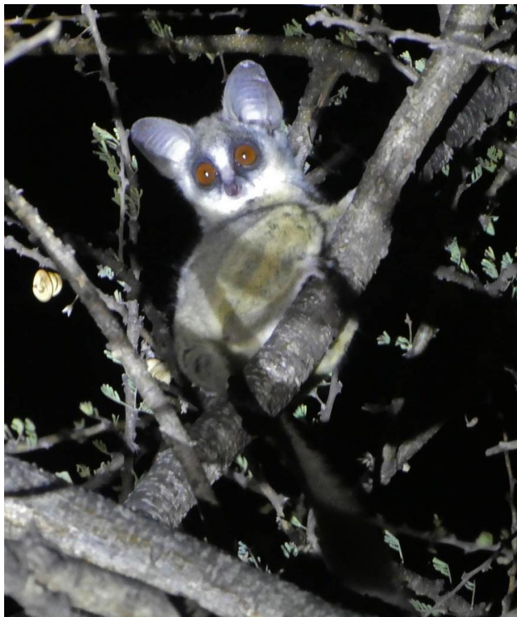
Southern Lesser Galago