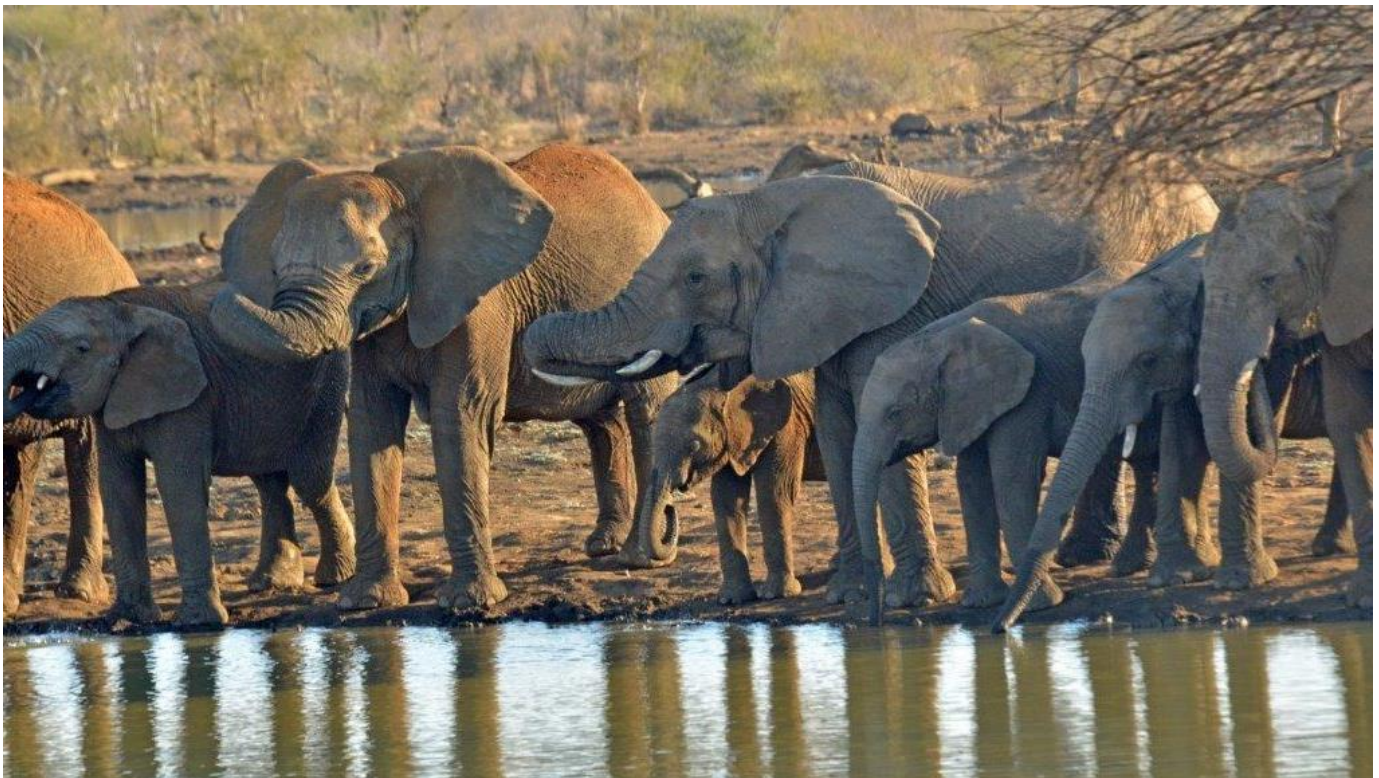
African Bush Elephants