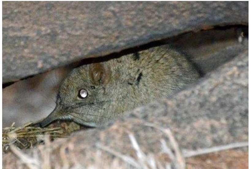
Western Rock Sengi (Anita Lloyd)

Before leaving we fortunately decided to check another nearby kjoopie, and got lucky when Brenda found a Western Rock Sengi sheltering from the wind in a crevice. It proved elusive at first but eventually everyone was able to enjoy good views of this much sought after species. Very happy with this unexpected success we headed back to the lodge finding our only Short-toed Rock Thrush of the trip on route.