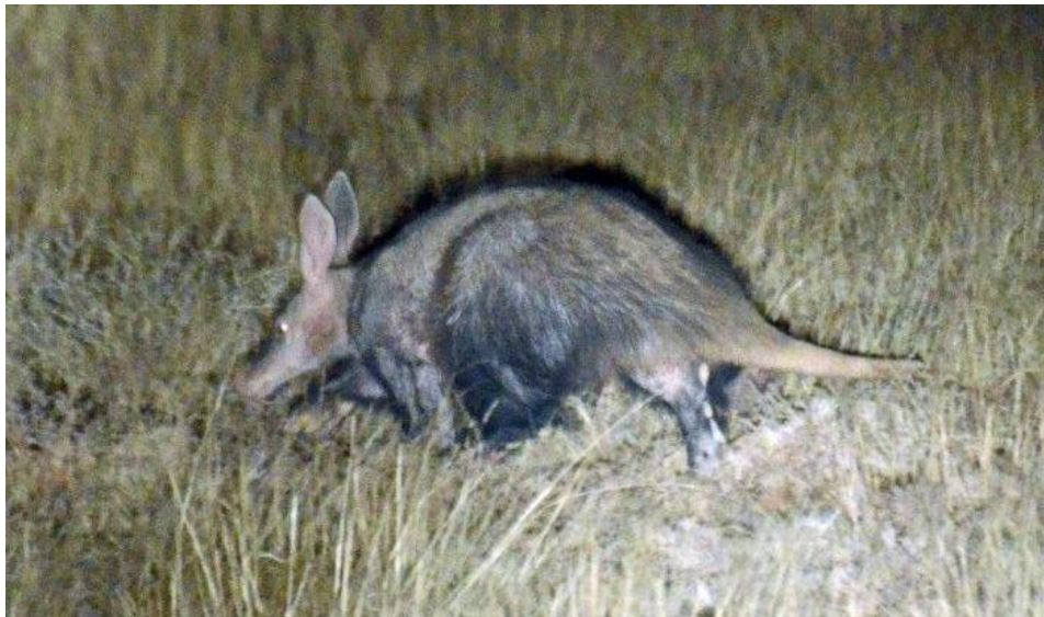
Aardvark (Anita Lloyd)

On arrival in Kimberley we quickly transferred to the Marrick Game Farm where after checking into our rooms we set out on a short pre-dinner game drive where we were able to enjoy Bat-eared Fox, Black-backed Jackal, Yellow Mongoose, Black Wildebeest, Red Hartebeest and introduced Sable along with some good birds including Spotted Eagle Owl, Double-banded Courser and Spike-heeled Lark.