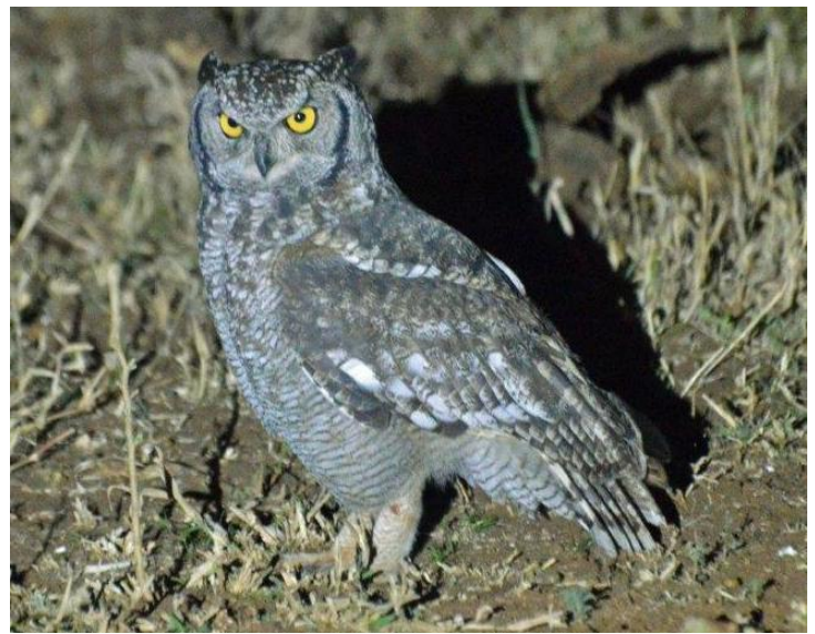
Red-crested Korhaan and Spotted Eagle-Owl (Anita Lloyd)