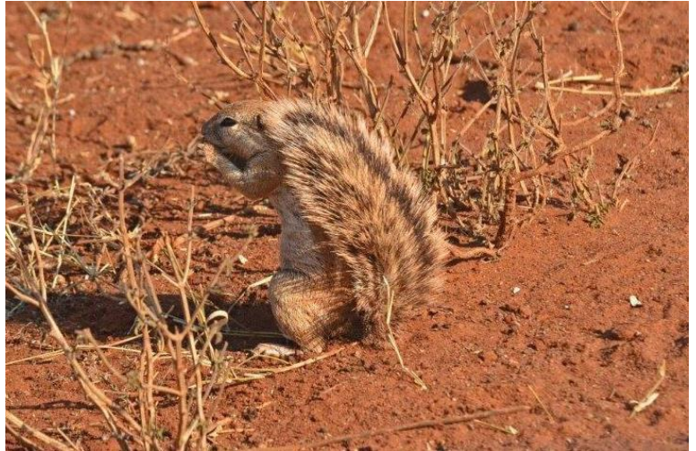
South African Ground Squirrel