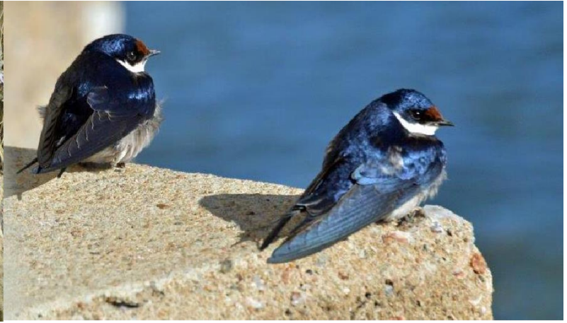
White-throated Swallows (Anita Lloyd)

After hot drinks and cereal back at the lodge we headed out with packed breakfasts and lunches for a day along the Vaal River at Warrenton about 70 kilometres north of Kimberley.