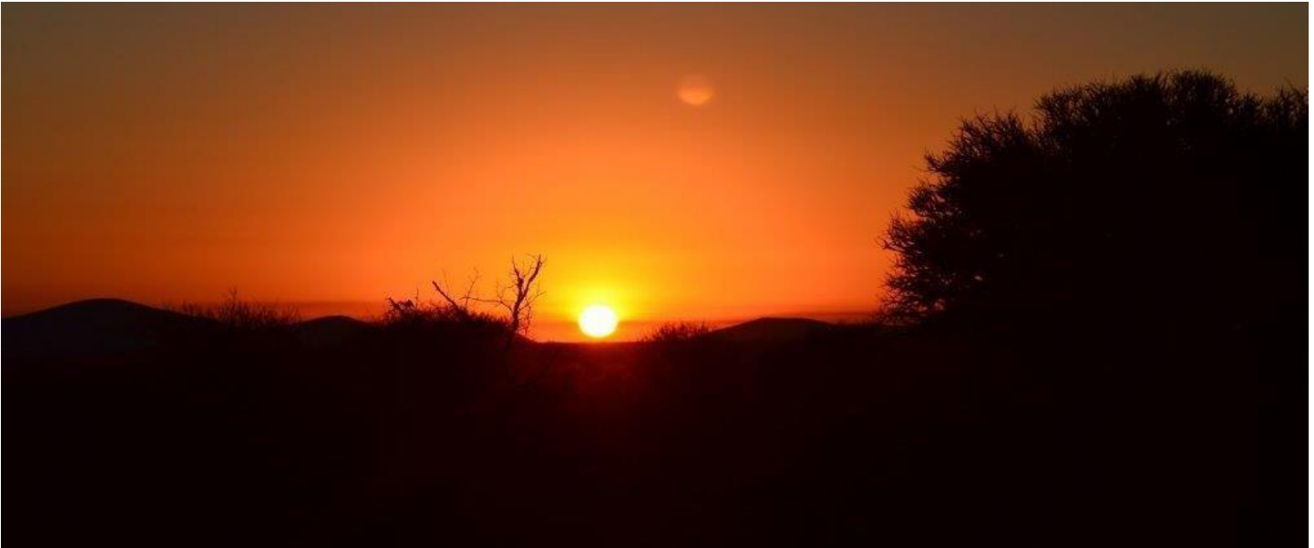
Madikwe Sunset (Anita Lloyd)

Once out of the park we made good progress and after a stop for a quick lunch at a Wimpy at Sun City Village, and a change of driver shortly afterwards, we eventually arrived back at the airport after another highly successful trip.