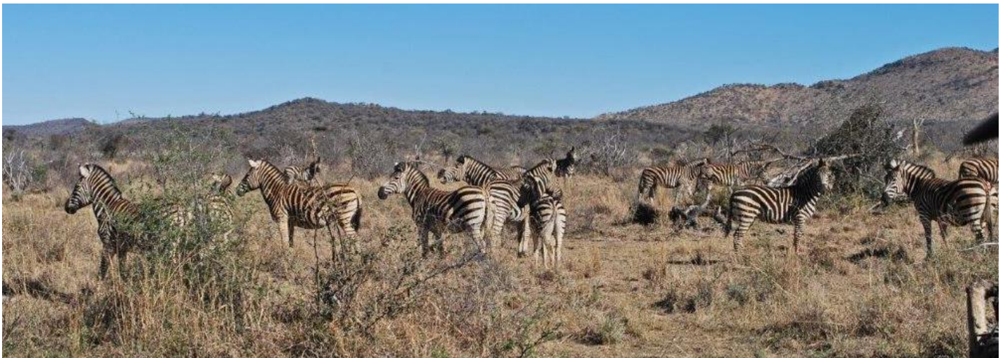
Plains Zebra (Anita Lloyd)

Our next stop turned up a nice selection of ungulates on the opposite hillside including Black Wildebeest, Blesbok and Plains Zebra . Continuing along the route we also encountered Red Hartebeest and Eland . We eventually reached the plains area of the park where we were able to enjoy large numbers of Black Wildebeest, Blesbok, Plains Zebra and Chacma Baboon with smaller numbers of Eland and South African Springbok .