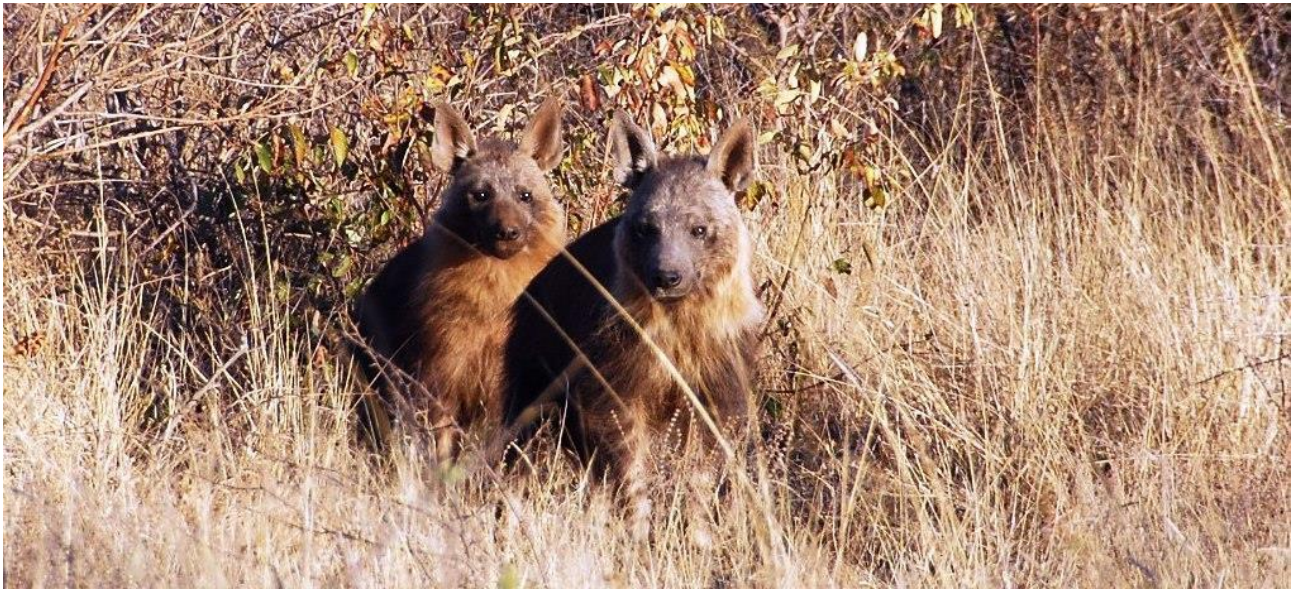
Brown Hyenas (Fiona McHugh)

Our final full day in Madikwe started early with an 0530 departure as we were heading out to the western reaches of the park to look for Western Tsessebe. On the drive out we encountered a further six White Rhinos including a group of four before having superb views of two sub-adult Brown Hyenas , our 8th and 9th of the trip, in nice early morning light.