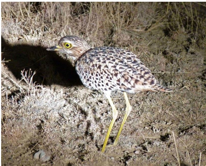
Spotted Thick-knee (Mervyn Griffin)