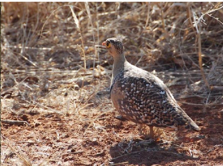
Double-banded Sandgrouse