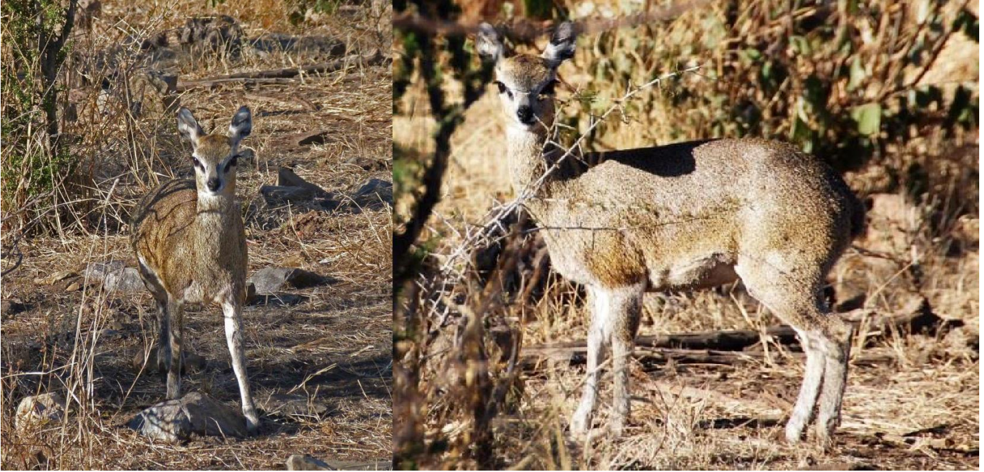
Transvaal Klipspringer (Mervyn Griffin and Fiona McHugh)

During the short gaps between breakfast, lunch and high tea we either rested or birded the lodge grounds and Nile Crocodile, Water Monitor and several Striped Skinks were all encountered while the river crossing was visited by a procession of ungulates.