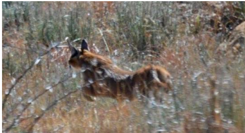
Caracal (Anita Lloyd)

Continuing onwards Mervyn suddenly shouted ' Caracal ', and Jan quickly reversed just in time for us all to see a large male Caracal sitting by the side of the road before it suddenly took off and tore up the hillside. A totally unexpected bonus and without doubt one of the highlights of the trip. Anita may well have found the clawless otters, Marsh Owl and Meerkats but Mervyn had trumped all three in one move.