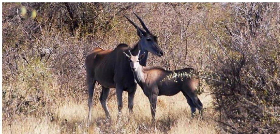
Eland (Fiona McHugh)