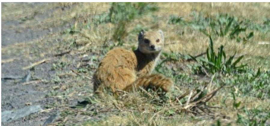
Yellow Mongoose (Anita Lloyd)

After an excellent breakfast we headed out to Marievale but had to turn back after 100 metres when Richard realised that he'd left his binoculars in the room, the second person to do so in two days. The plan was to try to see more otters but both species proved elusive in the cool windy conditions. We did however have good views of a couple of Yellow Mongoose and a couple of people had a brief view of a Slender Mongoose .