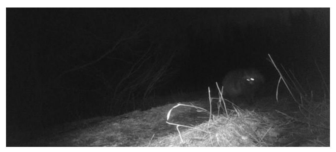
Raccoon Dog

After recovering two trail cameras which Peter had set in the forest, we set off on an uneventful morning drive to Saaremaa Island. Later that day, we were to discover that one of the cameras had been visited by a Raccoon Dog!