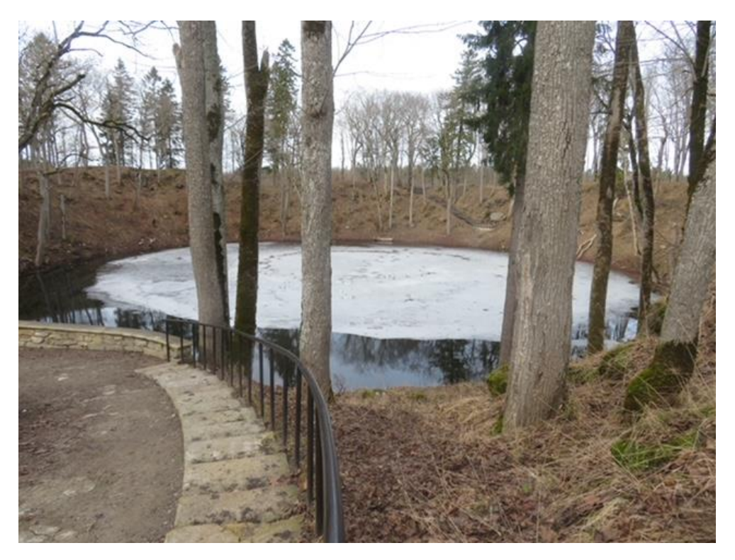
Kaali Crater (Peter Waldron)

Unfortunately, an afternoon visit to Tuhu Bog back on the mainland had to be rapidly curtailed due to heavy rain and we hot-footed it back to Tallinn for our final night at the Go Hotel Shnelli but not before we had found a rather desolate looking Smooth Newt in the middle of the track.