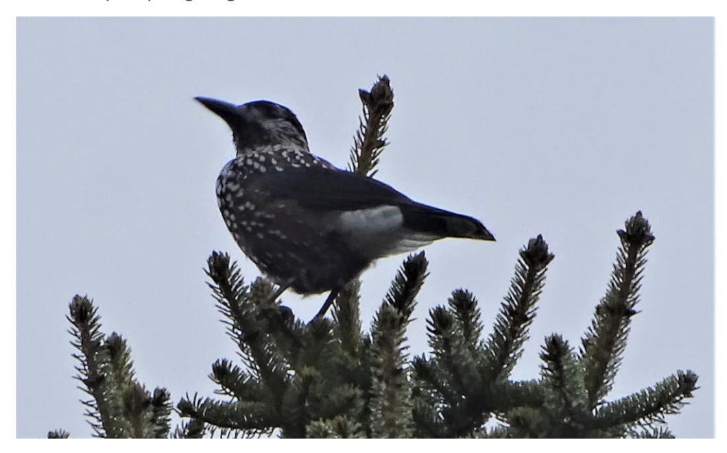
Spotted Nutcracker (Ewan Davies) / White-tailed Eagle (Peter Waldron)

Eagles . A visit to a nearby Vihula Manor failed to produce the hoped-for White-backed Woodpecker but the first Kingfisher of the trip was a welcome addition to the trip list. After a pleasant lunch in Rakvere, we headed back to the hotel for a pre-spotlighting rest.