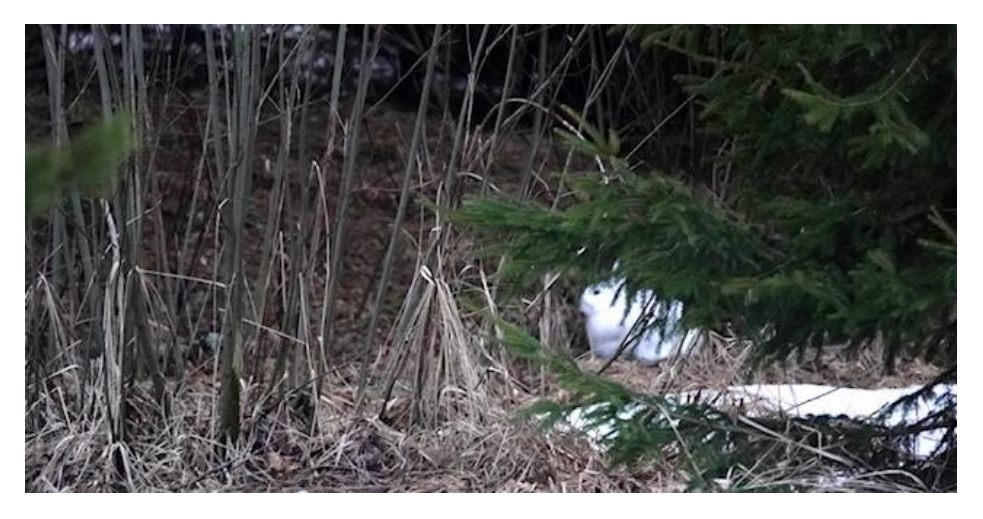
Mountain Hare

concluded around 10:40. Three of the group retired for the night while the others warmed up with a hot drink before another session up to around 1 am. This ironically proved highly productive with a large Wild Boar and a Red Fox near the hotel, two Raccoon Dogs which crossed the track but annoyingly stopped to look at us at the edge of the spotlight range but best of all a stunning Eurasian Polecat which we followed as it worked its way along a ditch for almost a minute, before it appeared to disappear into a hole. A great end to our final night in Lahemaa.