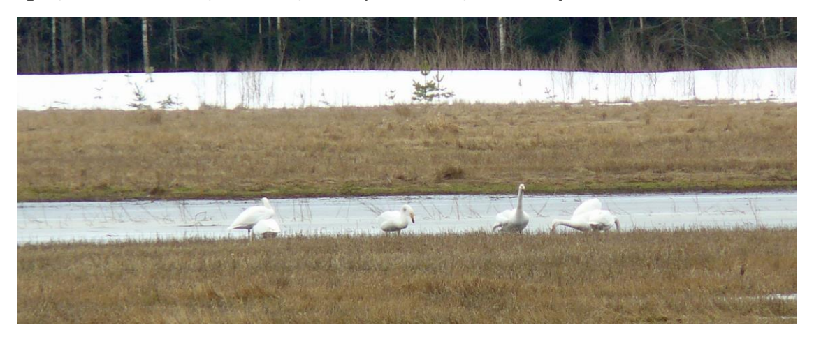
Whooper Swans (Brian Martin)

Heading out into the park our drive and a number of short walks produced our first Whooper Swans , White-tailed Eagles , Common Cranes , Crossbills , a lovely Willow Tit , Great Grey Shrike and Red Fox .