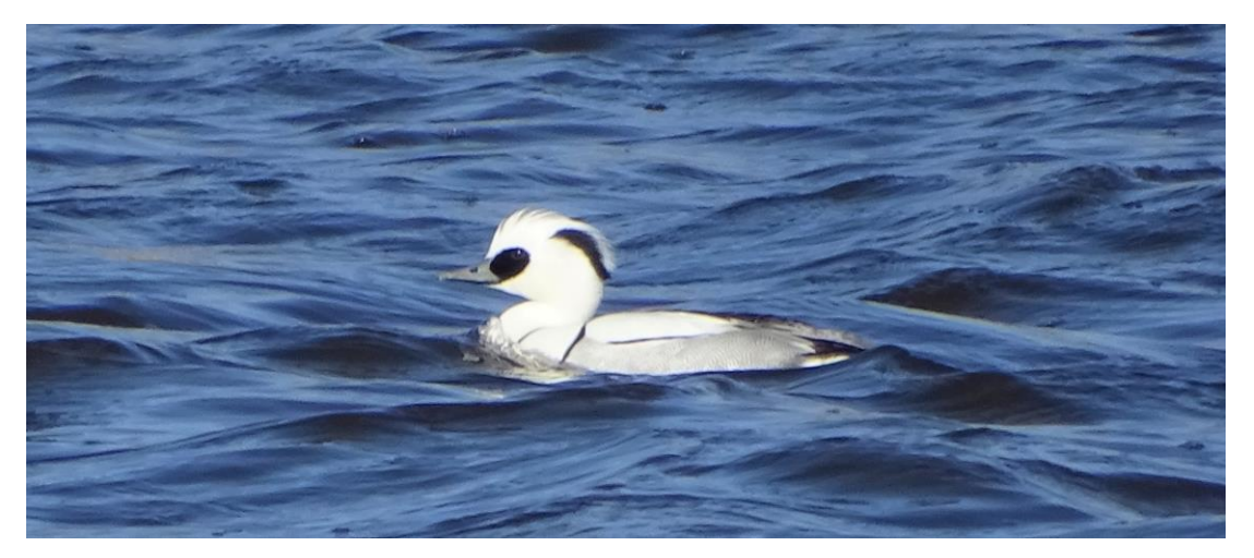
Smew (Ewan Davies)

After breakfast, our only Barnacle Geese of the trip, a group of eight, were found with a mixed flock of Greylag and Greater White-fronted Geese not far from our hotel, as we headed out for another Hawk Owl attempt at a third site near Kuressaare but we sadly dipped again, although we did find another Great Grey Shrike. A visit to a tower at a nearby lake (Suurlhat), added a few new birds for the trip including Bearded Tit and a booming Bittern along with the first butterflies of the trip, five Brimstone and a Small Tortoiseshell , while a nearby bay at Kuressaare lossipark produced a couple more trip ticks including three Great Egrets , although two close drake Smews were rather more appreciated.