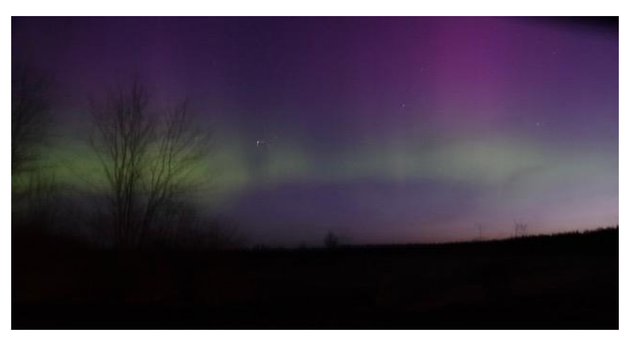
Northern Lights (Peter Waldron)

After breakfast, our only Barnacle Geese of the trip, a group of eight, were found with a mixed flock of Greylag and Greater White-fronted Geese not far from our hotel, as we headed out for another Hawk Owl attempt at a third site near Kuressaare but we sadly dipped again, although we did find another Great Grey Shrike. A visit to a tower at a nearby lake (Suurlhat), added a few new birds for the trip including Bearded Tit and a booming Bittern along with the first butterflies of the trip, five Brimstone and a Small Tortoiseshell , while a nearby bay at Kuressaare lossipark produced a couple more trip ticks including three Great Egrets , although two close drake Smews were rather more appreciated.