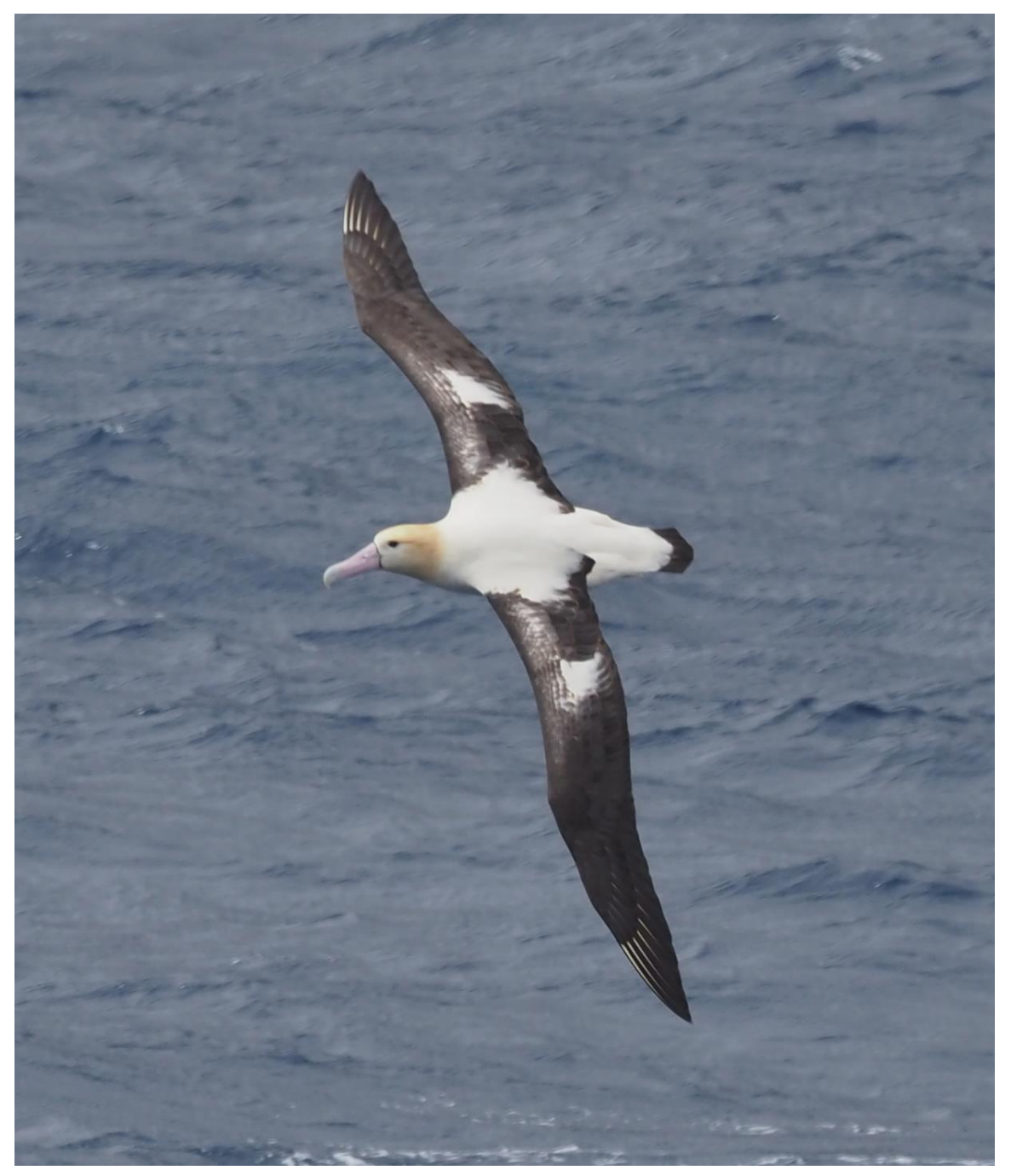
Short-tailed Albatross off Torishima Island April 2023