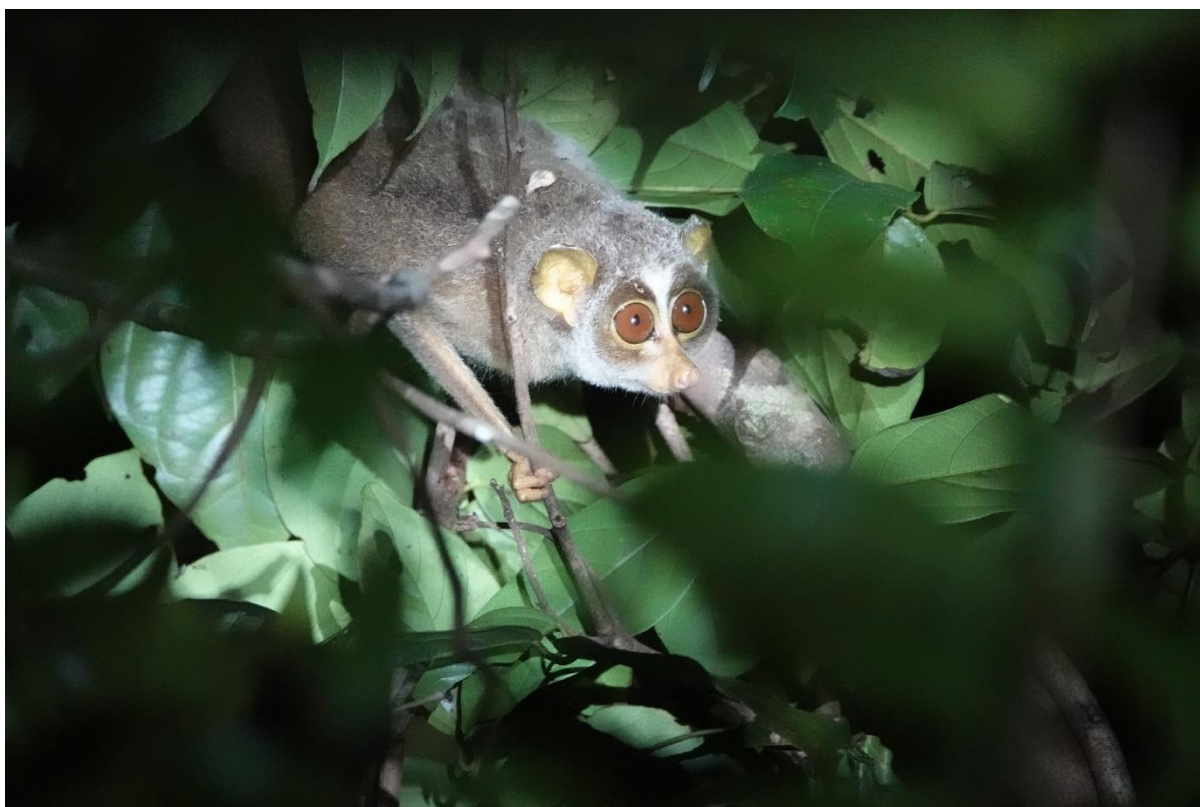
Red Slender Loris

On the way back to the hotel, Shelia found a few Blue Forest Scorpions using an ultraviolet touch.