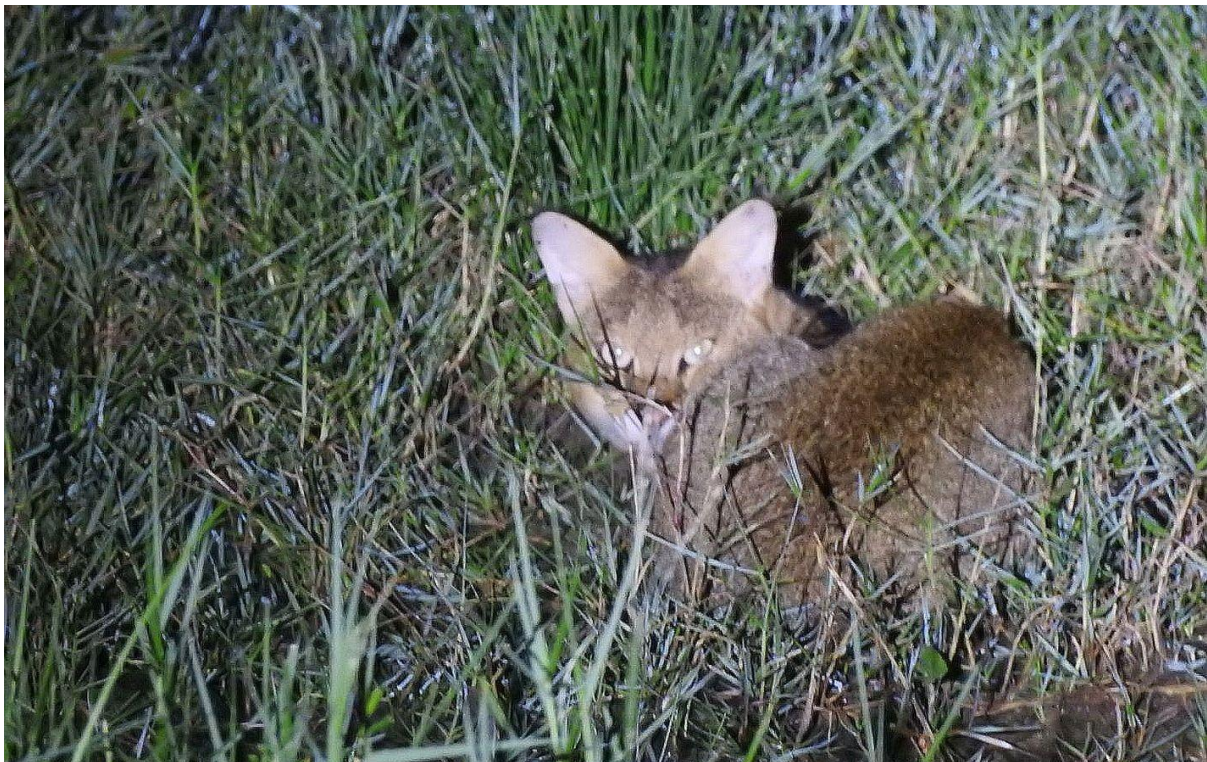
Jungle Cat

This was highly successful and the new mammal species included Northern Palm Civet, White-spotted Chevrotain and Sri Lankan Spiny Mouse.