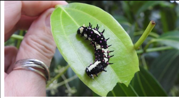
Common Meme Swallowtail larva