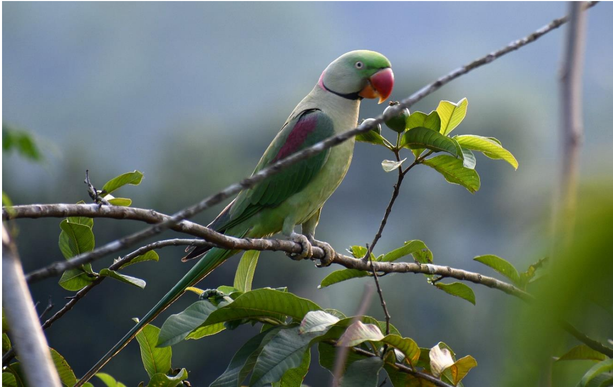
Alexandrine Parakeet