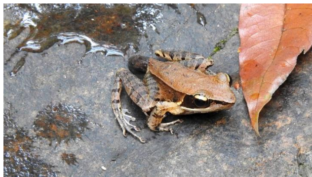
Gunther's Golden-backed Frog