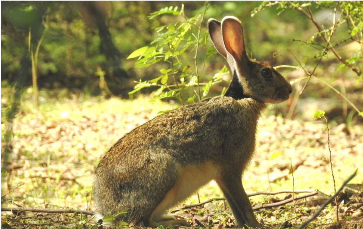
Indian Hare