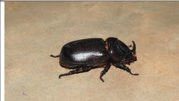
Rhinoceros Beetle sp.