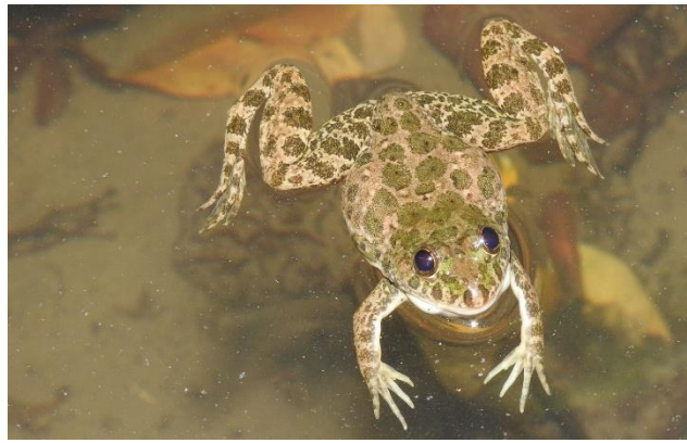
Common Skittering Frog