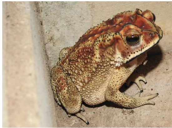
Asian Common Toad