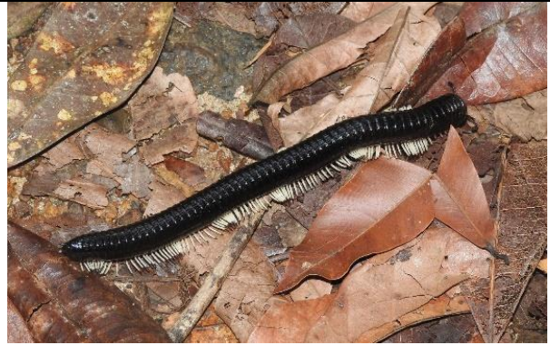
Giant Millipede