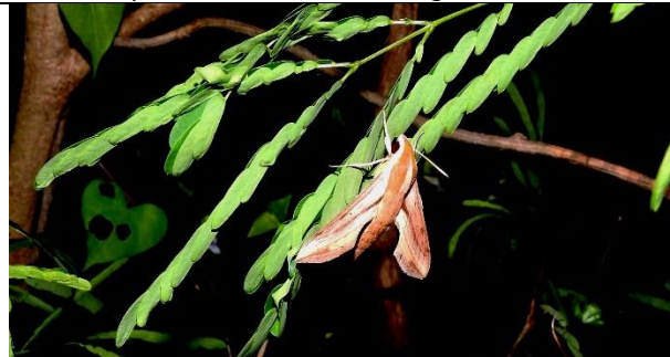
Swinhoe's Striated Hawk-mot