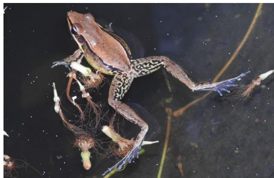
Gravenhorst's Golden-backed Frog