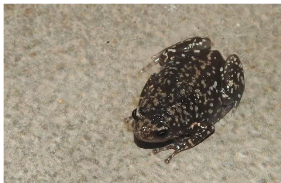
Rohan's Globular Frog