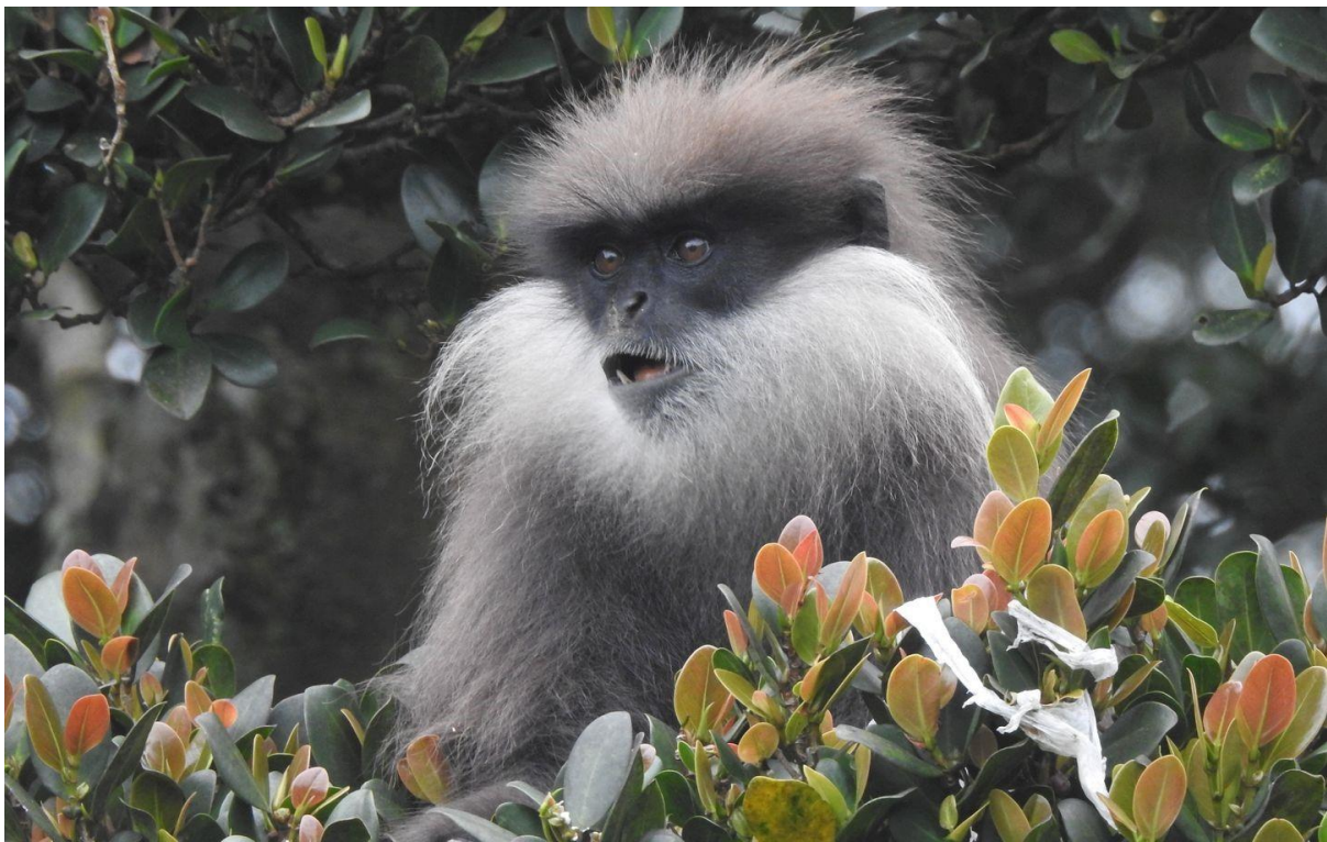
Purple-faced Langur