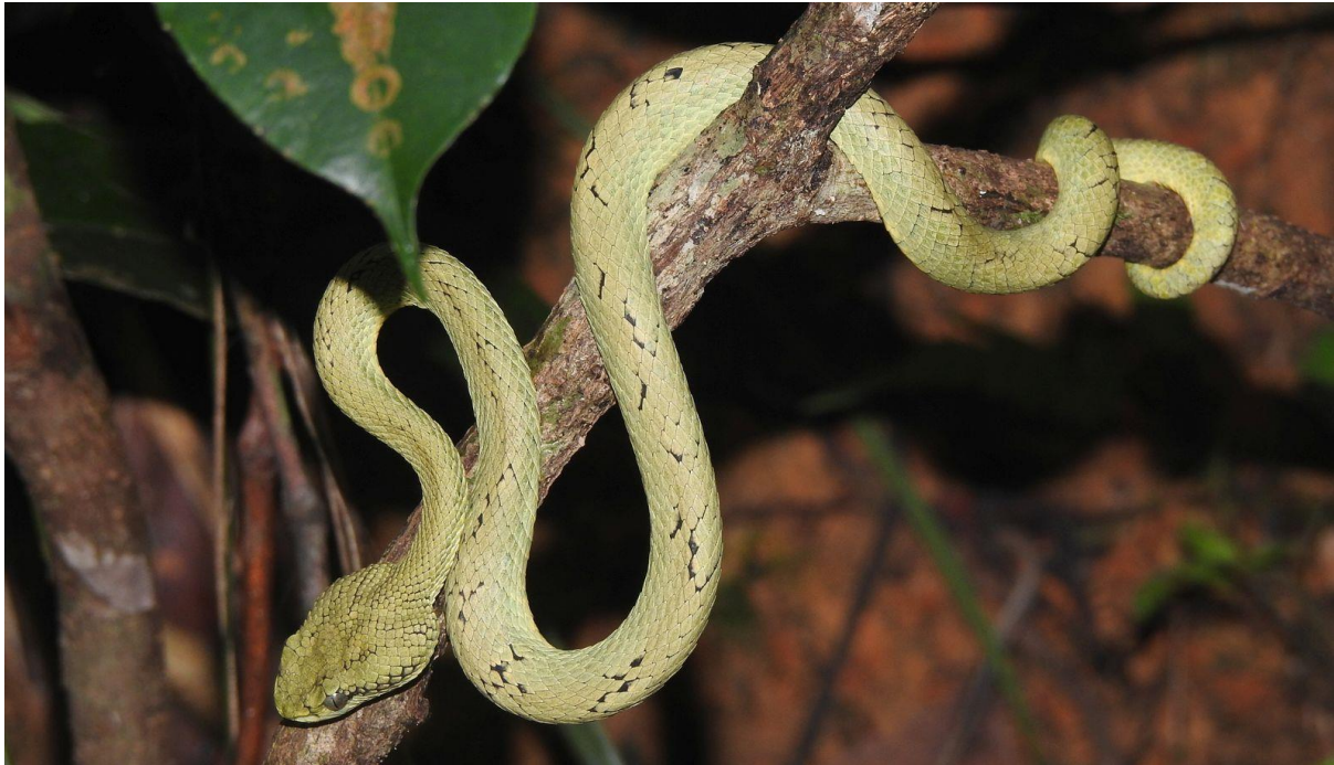
Sri Lankan Green Pit Viper

After breakfast, we drove back to Kanneliya Rainforest where our main goal was to visit a bat cave to see the Schneider's Leaf-nosed Bat colony, also finding a very confiding Sri Lankan Green Pit Viper on the way there.