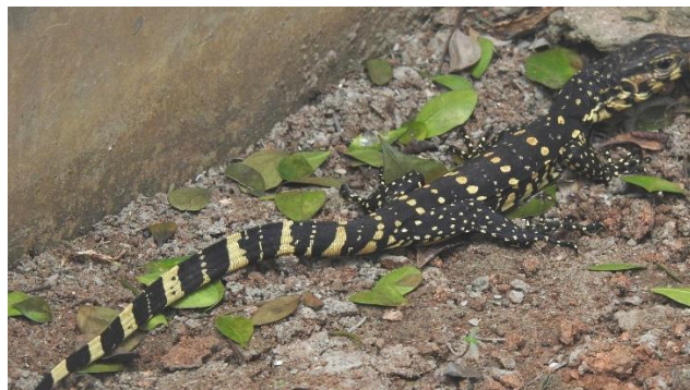
Asian Water Monitor