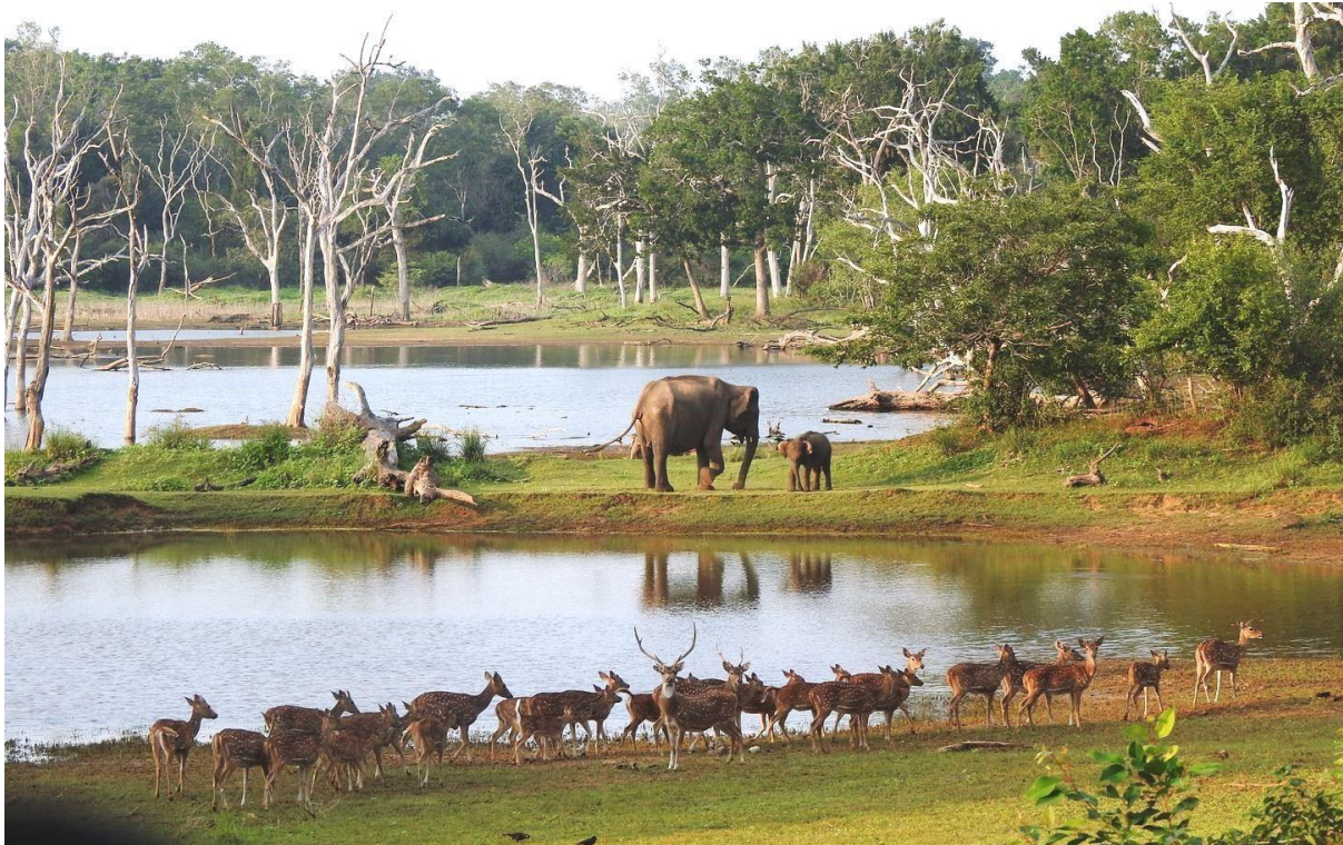
Asian Elephant and Chital

Heading out at 21:30, we found several Northern/Small Indian Civets, a Grey Slender Loris (which was the first for the trip), as well as a couple more Jungle Cats. At 03.00am, we called it a night and headed back to our hotel.