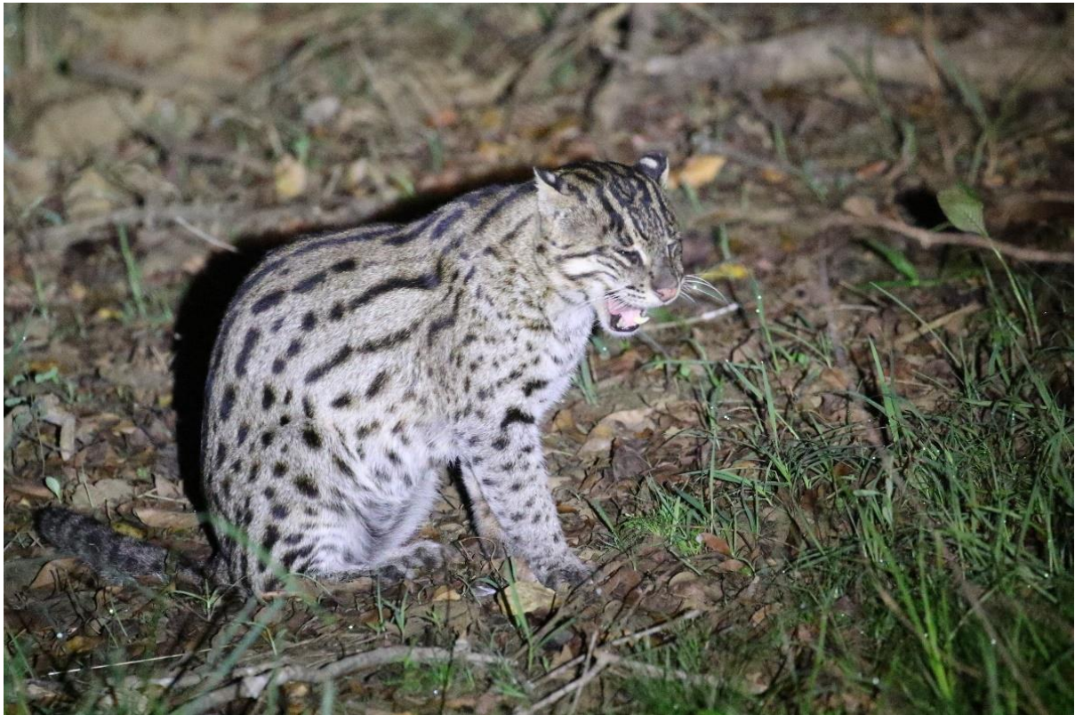
Fishing Cat

WildWings, Birds and Wildlife Limited, 9 Pound Close, Long Ditton, Surbiton, Surrey KT6 5JW Tel: +44 (0)117 965 8333 email: tours@wildwings.co.uk • website: www.wildwings.co.uk