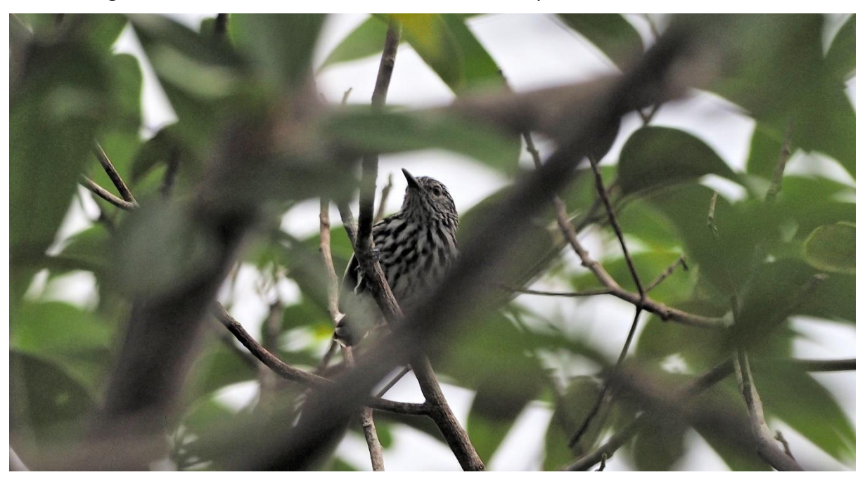
Cherrie's Antwren

Seen during our afternoon canoe ride at Janauacá on 5 September.