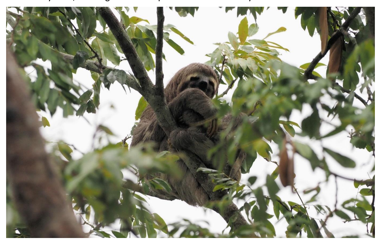
Brown-throated Sloth

One of these poorly-known opossums was seen by one of the canoes during the nocturnal excursion at Manapana on the evening of 10 September. Although the views were moderately brief, the diagnostic head pattern and thick bushy tail were seen.