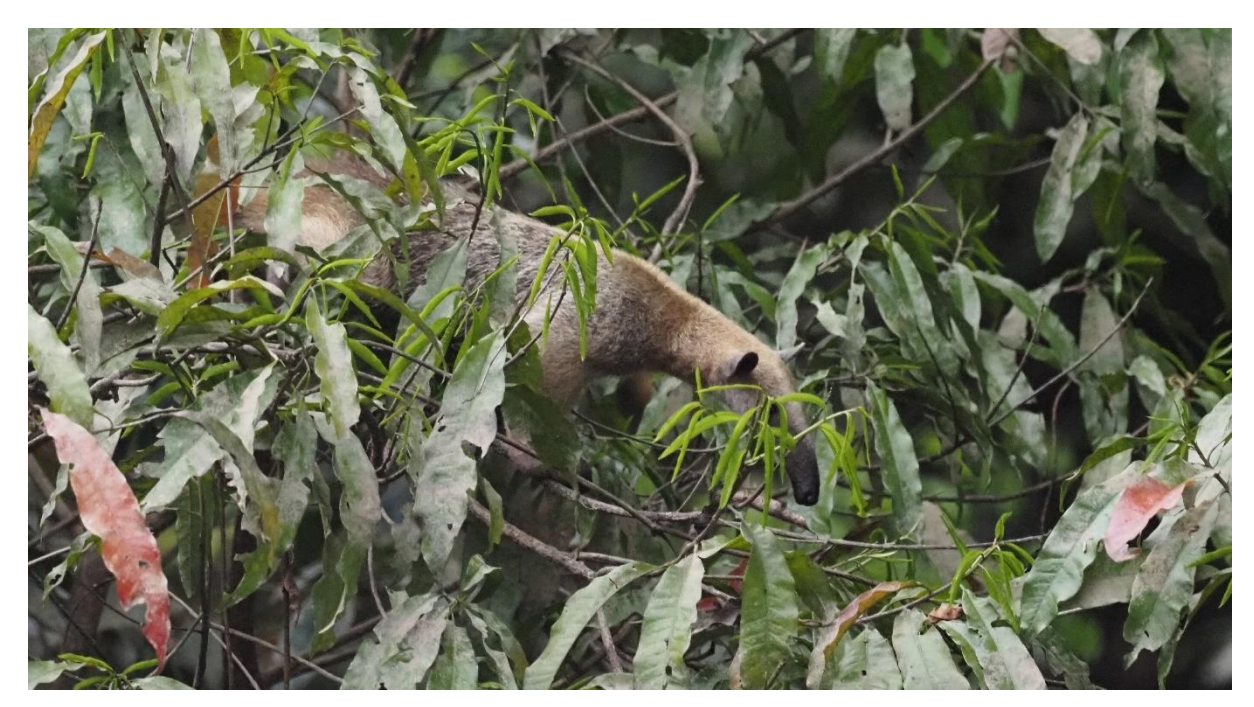
Southern Tamandua