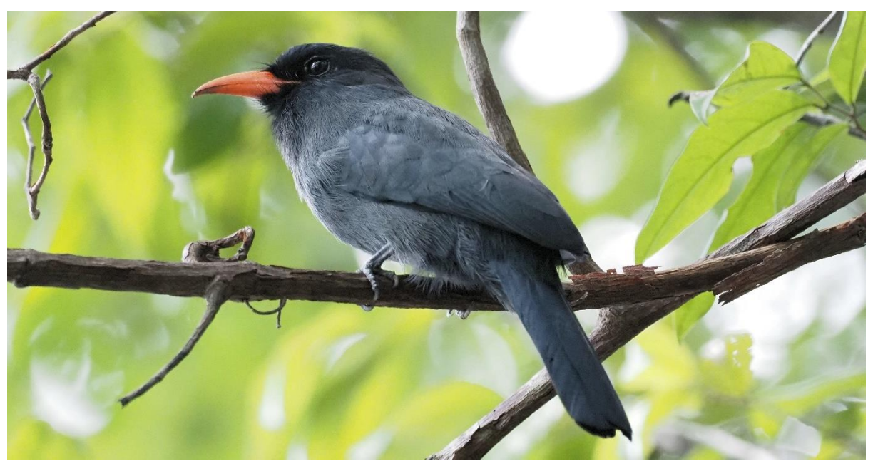
Black-fronted Nunbird

This Guianan Shield speciality was seen on two dates during the extension and then on a daily basis from 12-16 September.