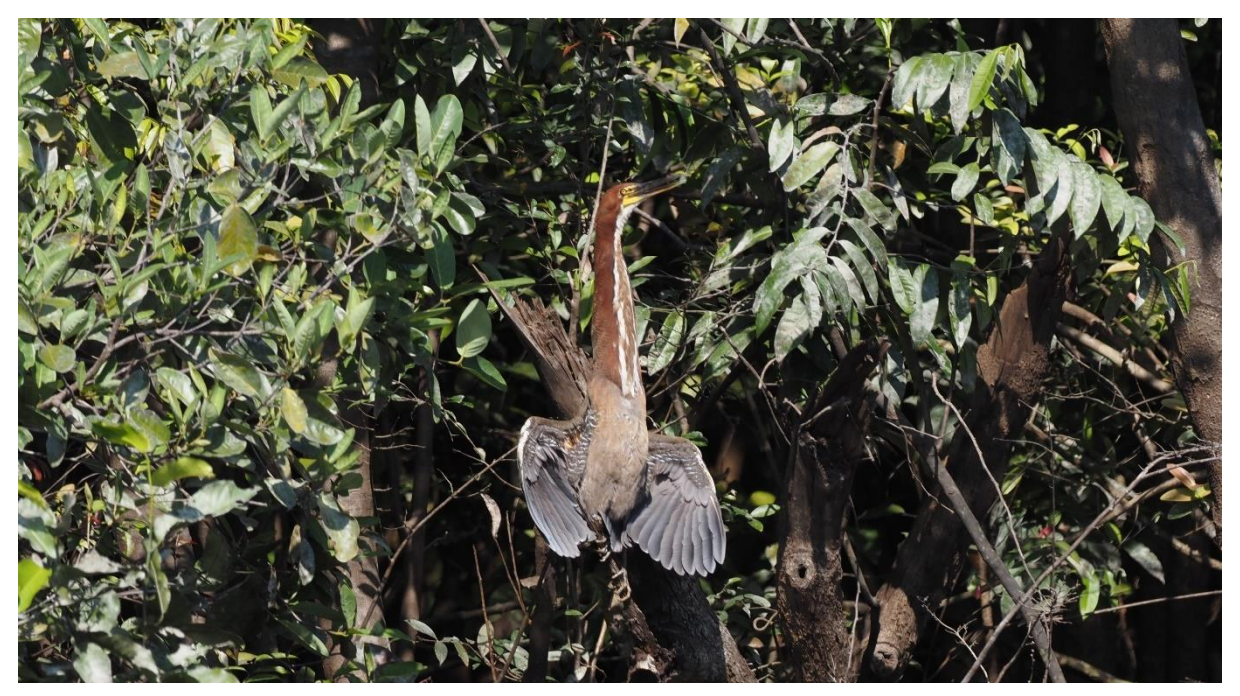
Rufescent Tiger Heron

A reasonably numerous species which was seen on nine days although our day counts were only ever in low single figures.