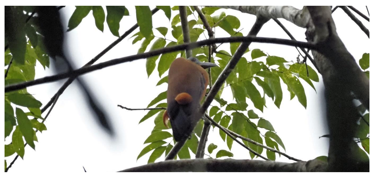
Capuchinbird © Chris Collins