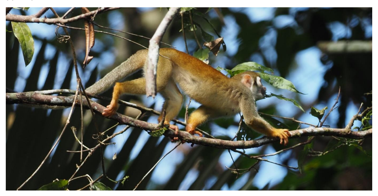
Guianan Squirrel Monkey

The first of three species of squirrel monkey seen on the trip and the one found on the southern bank of the Amazon and Solimões Rivers with this species logged on 5 September at Anra.