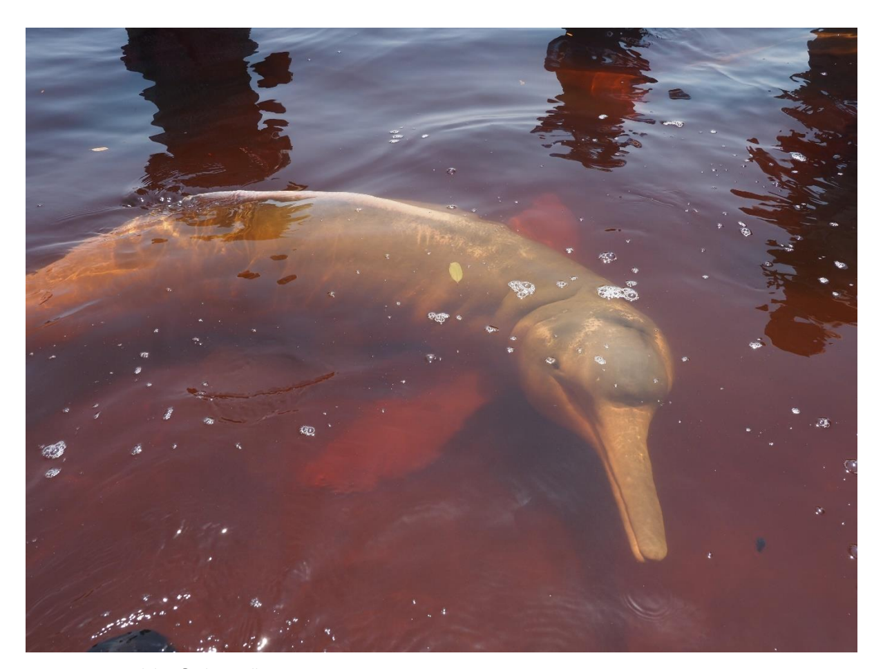
Amazon River Dolphin