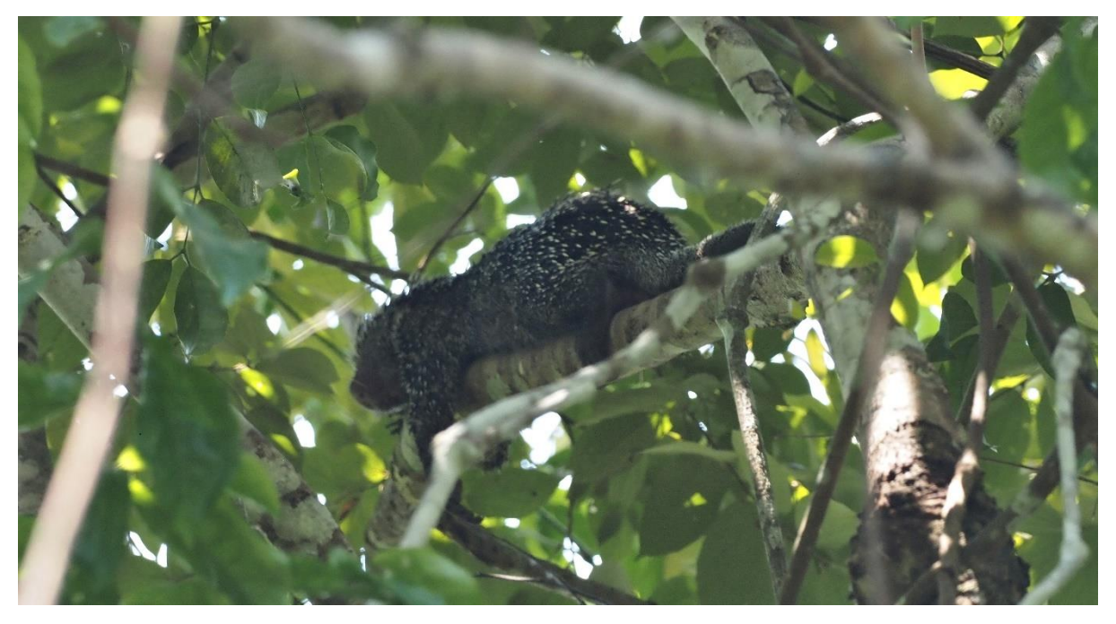
Brazilian Porcupine

A lone individual was seen on 9 September.