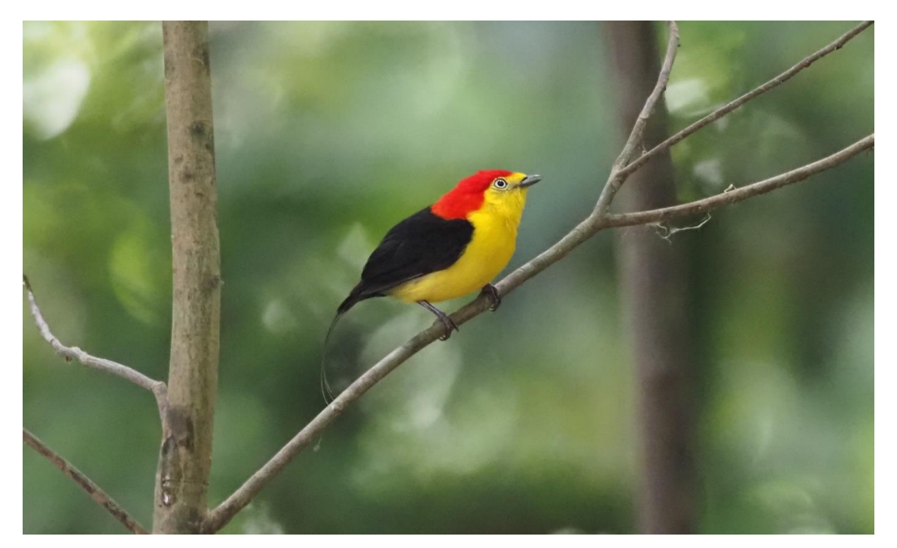
Wire-tailed Manakin