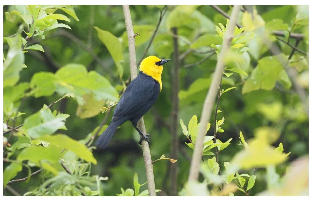
Yellow-hooded Blackbird

This species is fairly habitat specific (and typically inhabits relatively new river islands) and we only saw it on 5 September.