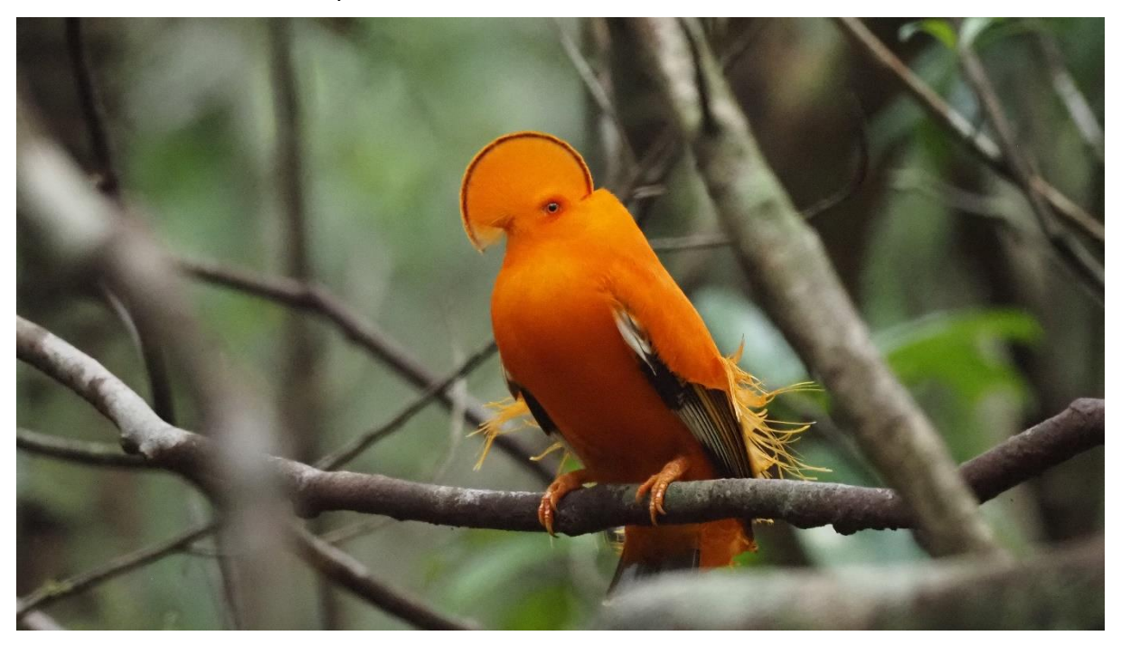
Guianan Cock-of-the-Rock