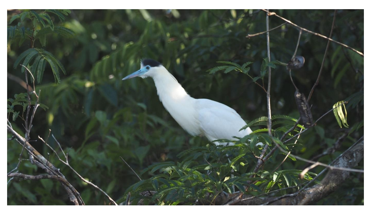
Capped Heron