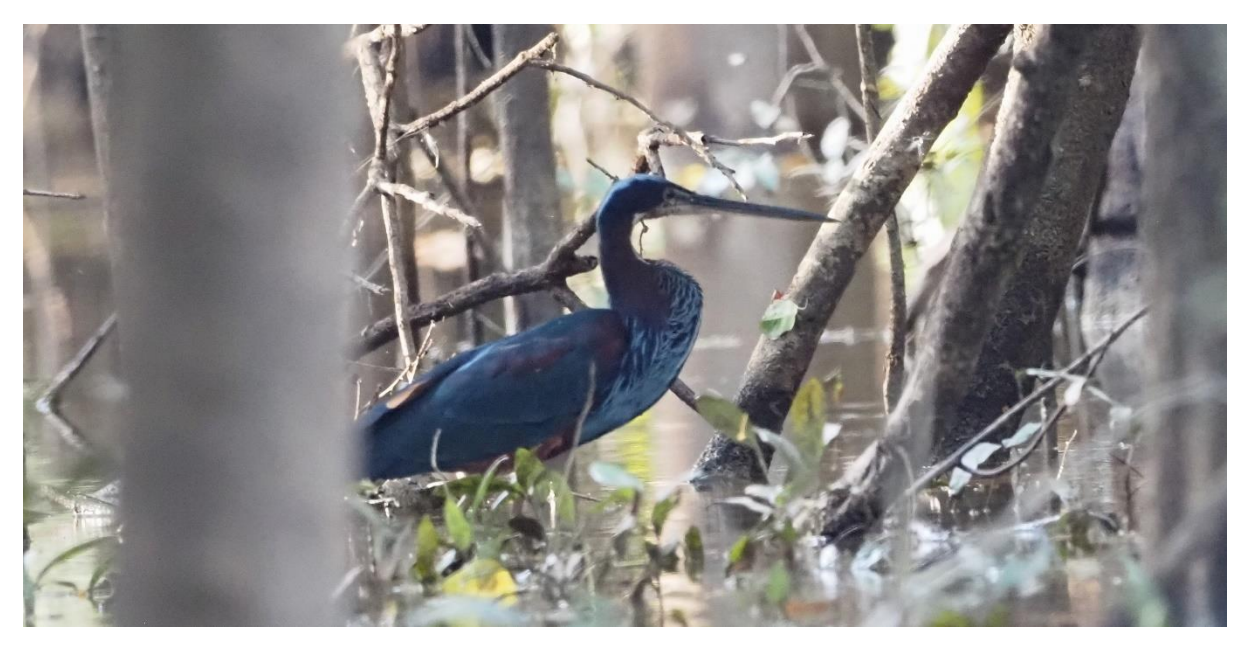
Agami Heron