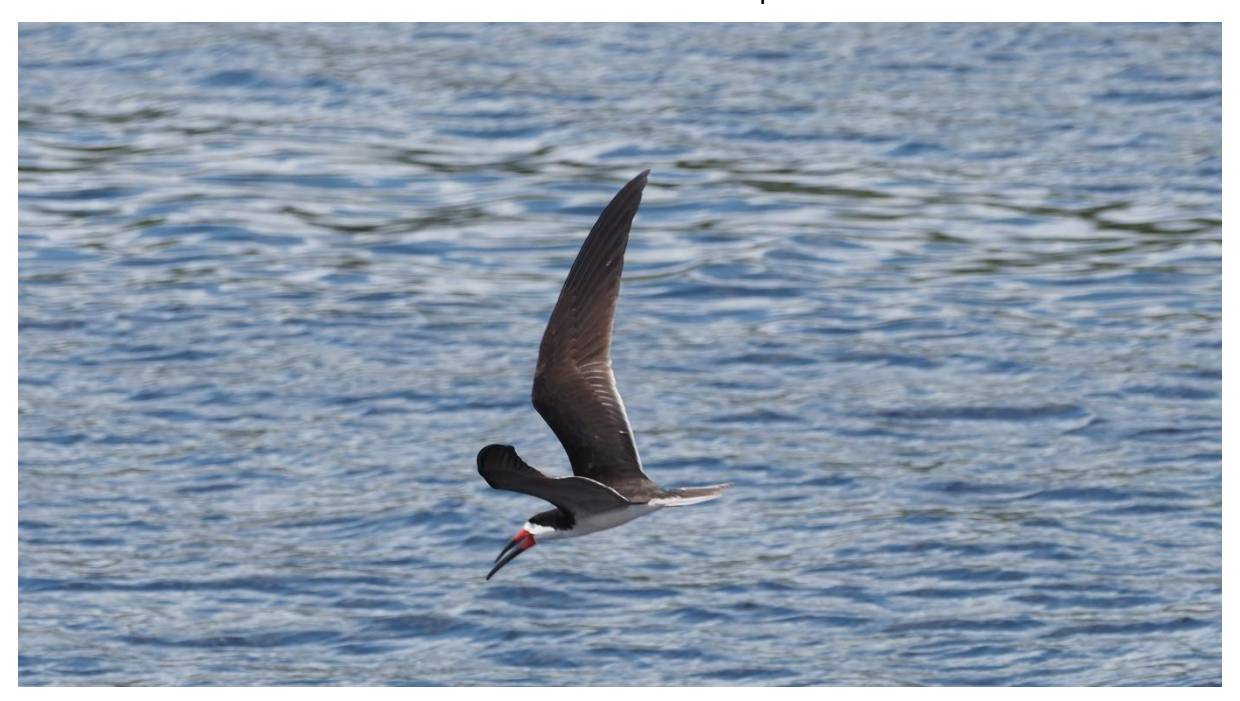
Black Skimmer

Several birds were with the other waders at Anra on 5 September.