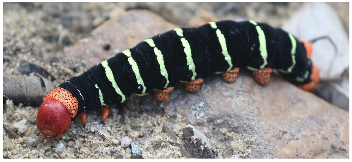
Sphinx Moth caterpillar

By mid-afternoon we had reached the small town of Novo Airão and once the temperature had moderated, we boarded the canoes for the short ride to a property Junior's family owned. This had been converted into a hotel, however, our reason for visiting was because there was a family of Spix's Night Monkeys which lived in the grounds and within a matter of moments of landing on the sandy shore, we were watching these rarely seen primates, having also seen the spectacular caterpillar of the Sphinx Moth near our landing site.